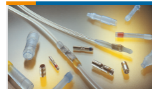
TE Model / Part #675547N005 D-436-0147CS2402