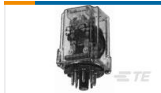
TE Model / Part #1393102-4 KRP-14DG-12=KA/KB/KC/KR