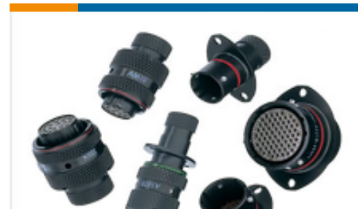
TE Model / Part #AS616-26SN PLUG BOOT TERMIN N TYPE 6