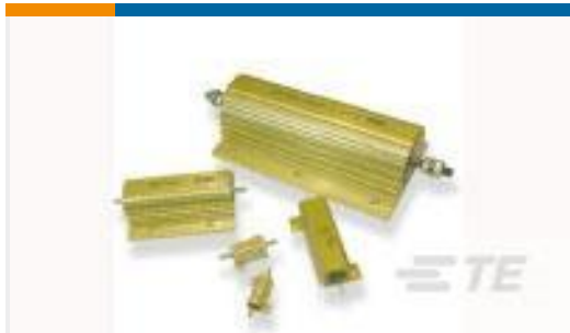
TE Model / Part #4-1630186-2 HSA50 13R6 5%