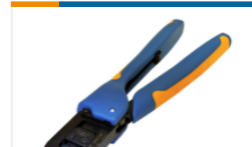
TE Model / Part #2217743-1 CERTI-CRIMP II HAND TOOL