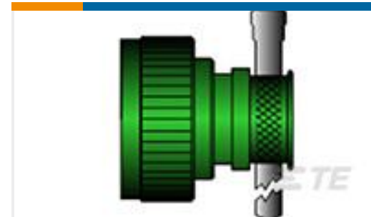
TE Model / Part #CW2897-000 R85049/88-15W03