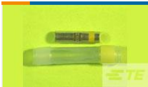
TE Model / Part #675547-000 D-436-0147