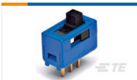
TE Model / Part #2-1437580-3 MSSA104D=(MSS)SW SLIDE 1 POLE/