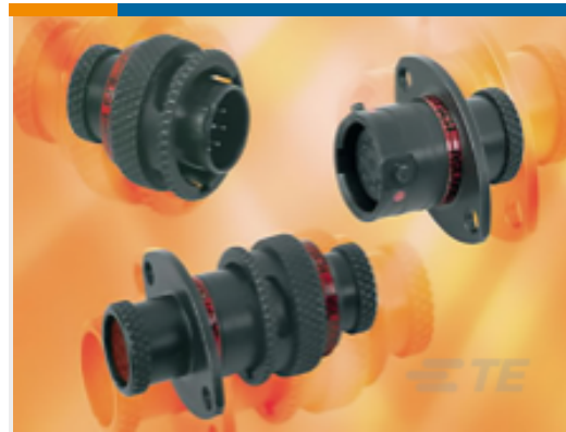
TE Model / Part #ASDD106-09SC-HE INLINE RECEPT ASSY. ASDD 9 WAY.