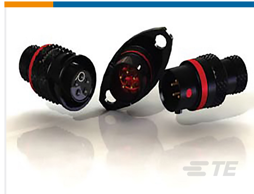
TE Model / Part #ASX002-05SE-HE RECEPTACLE ASSY AS SIZE 2 5 WAY