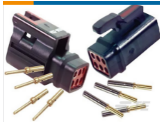
TE Model / Part #ASC105-06SN RECEPT.AS MODULAR. SKT.