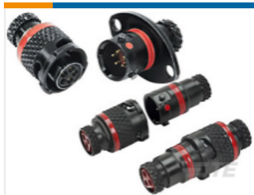
TE Model / Part #ASU103-05PC-HE INLINE RECEPT ASSY ASU 5 WAY