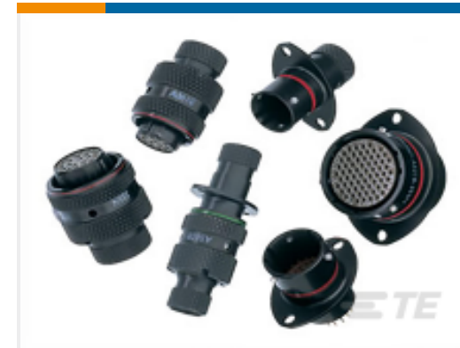
TE Model / Part #AS622-55PN PLUG BOOT TERMIN. TYPE 6