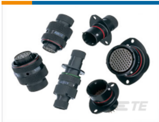
TE Model / Part #AS612-35PN PLUG BOOT TERMINN TYPE 6