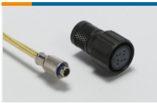
Standard Circular Connectors(567)