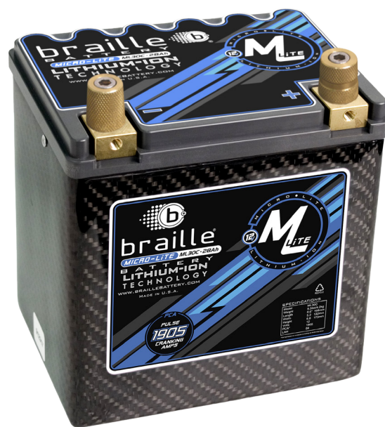
ML30C Model with TrueTorque™ Terminals attached

Voltage: 12 volts Full Charge Voltage Range: 13.8 volts Pulse Cranking Amps (PCA) 5 sec @ 80F*: 1905 Lead-Acid Equivalent Capacity: 84 Lithium AH (LAH) Nominal Capacity (C/20 rate)*: 28 AH Life Cycle @ 10% DOD: Up to 5000 cycles