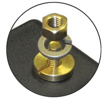
New Stud Terminal