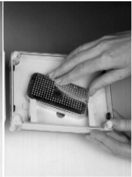
STE-110 with cover removed showing desiccant module and optional lightning arrester

Ordering Information Please state the following: Model: STE 110 OPTION A (if required): 2 inch pipe mounting kit OPTION B (if required)