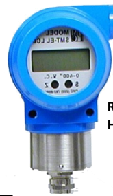
Remote Terminal Head and Display