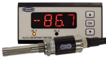
* AcuDew Dewpoint Transmitter sold separately

Fully self-contained within a robust housing, Model AcuVu provides weatherproof protection to IP65 (NEMA 4) when panel mounted (1/8 DIN). Requiring little or no maintenance and with low power consumption, the Model AcuVu provides long term signal accuracy and fast response time, suitable for even the most challenging industrial environments.