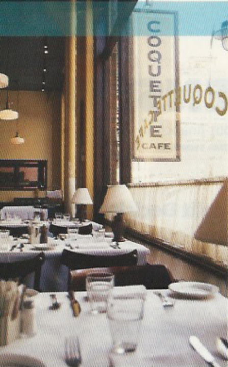
Two pleasing Milwaukee restaurants: the Coquette Cafe (top left) and Carnevor (bottom); The Home Market (right), a mecca for modern furniture