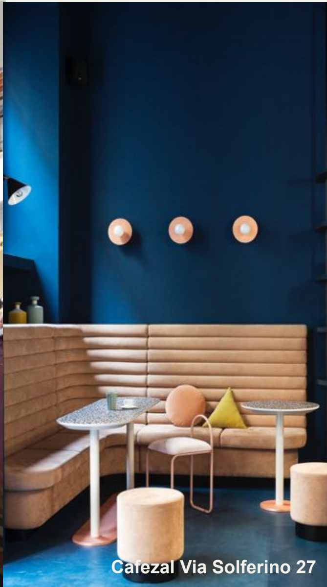
Cafezal Via Solferino 27