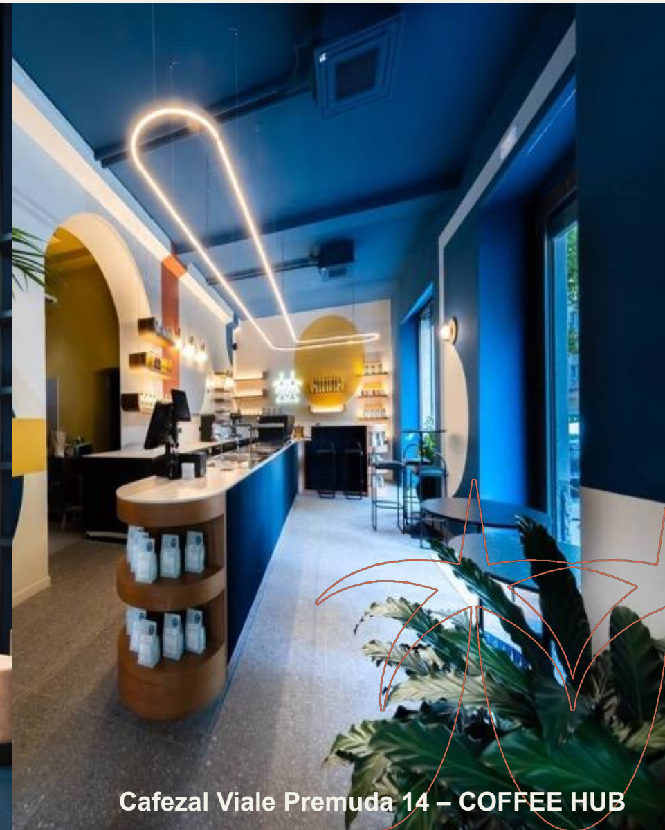
Cafezal Viale Premuda 14 - COFFEE HUB