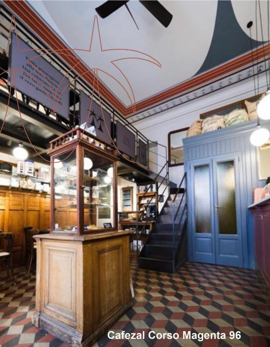
Cafezal Corso Magenta 96