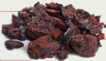
Dragon's Blood resin

↑ ↑ ↑ Enhance skin hydration and elasticity