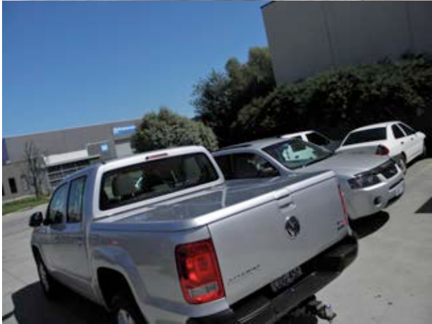
lid showing overrun at corners to facilitate easy lift from corners as well.