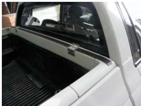
this is a Holden set up! But the hinge type is the same