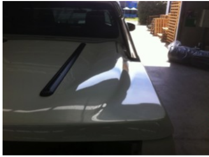
9. Remove bar