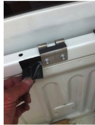
11. Thread brackets