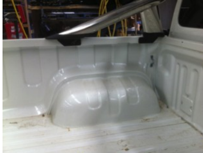
1. Remove bar