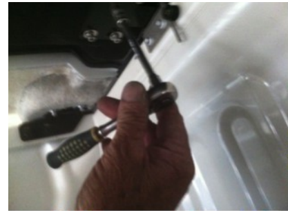
14. Reposition lid and secure lid with 8x ss bolts, lightly tighten