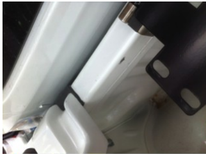
12. Mount female hinge