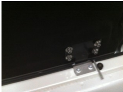
15. Attach pin retainer /locator Button.