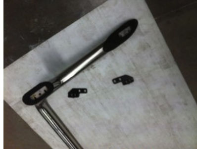
2. Lay upside down on foam remove brackets