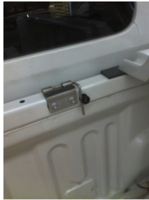
10. Lay upside down on foam remove brackets