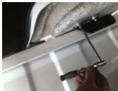
7. Replace infil with bar attached