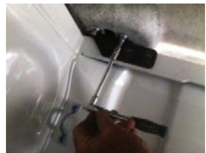
8. Tighten brackets when in position