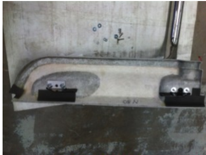
4. Attach to underside of infil mouldings (bolt on)