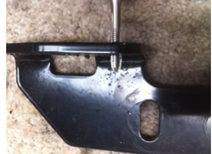
3. Thread brackets