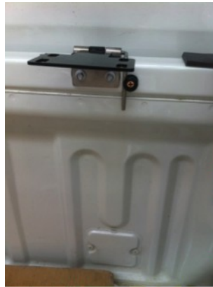
13. Assemble Hinge on tub