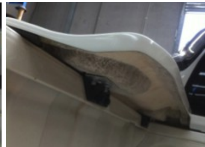
5. Lay foam tape across front edge of infil to sit on and seal