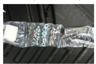
Open fittings Sleeve