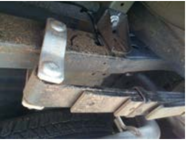
Feed wire thru chassis on driver's side