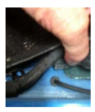
Remove rubber door seal and kick panel, attach control module to inside of panel feed power wire across underneath Instrument panel and go thru the firewall to the battery