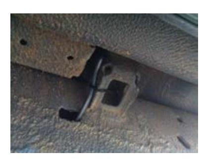
With a bit plastic blue tongue attached to wire come out near the underside of the driver's seat