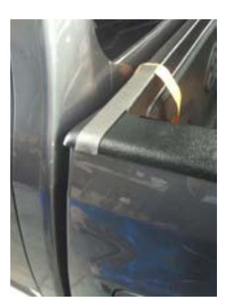
Replace sports bars and mount support bracket

Mount hinges on lid, put on vehicle, centre and mark female hinge position. Mount hinges with self tapping bolts thru liner.