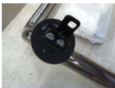
Remount feet with spacer washers under infill moulding