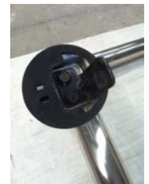
Remove bolts and discard

Remove sports bars and place on cushioned surface