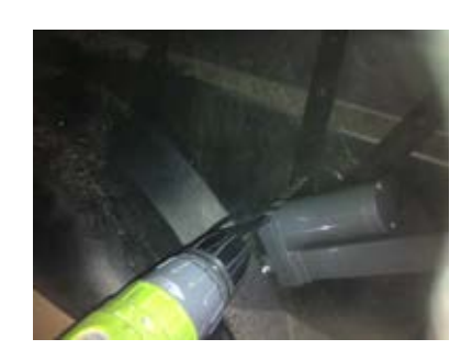
Attach support bracket and drill mount bottom support bolt. Attach thru tub with nyloc nut