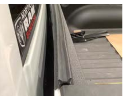
Stick seal to top of front wall, trim if necessary

6. Spread adhesive to cover area 7. under seal and let it tack dry