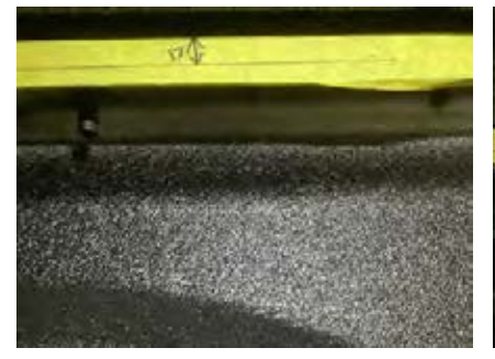
13. Mark a line 17 mm down from top of tup