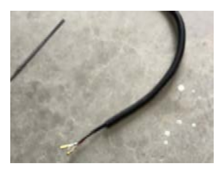
26. Fit wires from struts into corrugated power loom

25. Bring power loom between inner guard and firewall to underneath the car