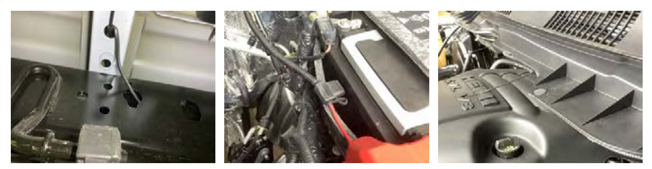
24. Connect power loom to battery and cable tie to loom across firewall to right hand side of car

22. Wire from struts exiting chassis 23. Connect wires and cable tie in place under drivers seat