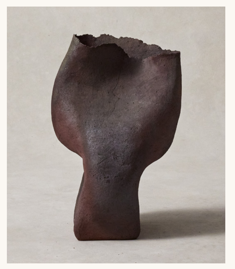
LUDMILLA BALKIS, RIFT, 2023, RED SANDED STONEWARE, 19.25"H X 10.25"W X 8"D