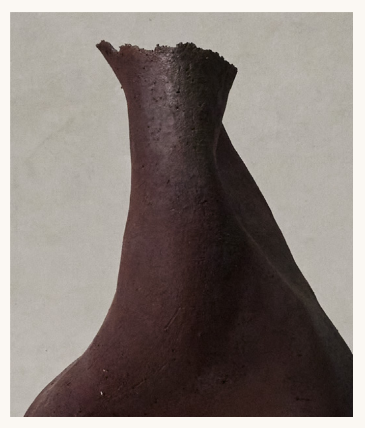
DETAIL, LUDMILLA BALKIS, RIFT, 2023, RED SANDED STONEWARE, 19.25"H X 10.25"W X 8"D