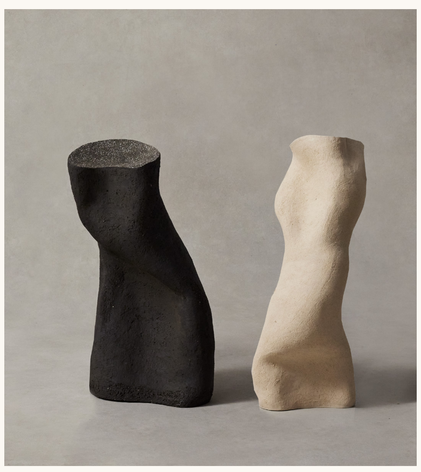
LUDMILLA BALKIS, BLACK & WHITE DIPTYQUE, 2023, WHITE SANDED STONEWARE & BLACK SANDED STONEWARE, 19.75"H X 7"W X 3.5"D, 20"H X 9.75"W X 6"D