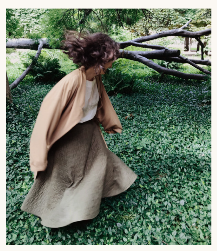
BALKIS ON A WALK THROUGH THE FOREST, WHICH SHE DESCRIBES AS WILD WITH BOTH STILLNESS AND MOVEMENT