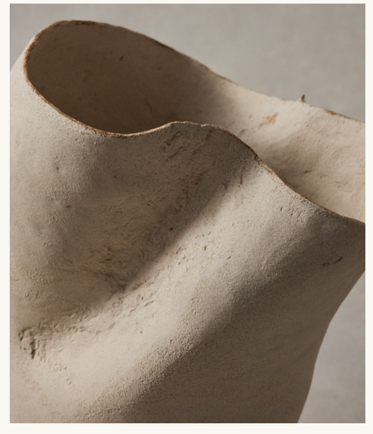
DETAIL, LUDMILLA BALKIS, OREKO, 2023, WHITE SANDED STONEWARE WITH WOOD ASH, 23.5"H X 15.75"W X 11"D