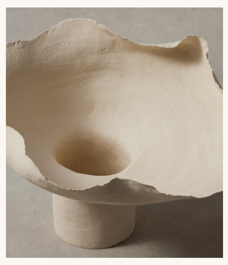
DETAIL, LUDMILLA BALKIS, HODEI, 2023, WHITE SANDED STONEWARE, 20.5"H X 27.5"W X 23.25"D