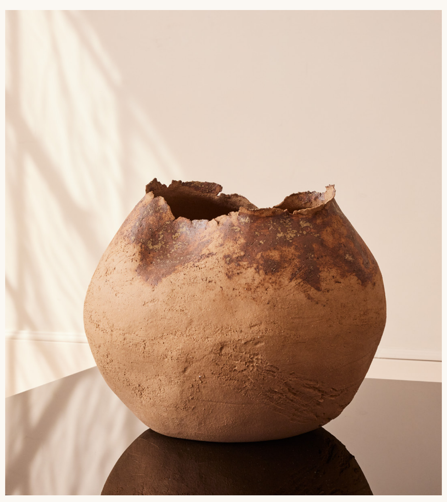
LUDMILLA BALKIS, HUTSA, 2023, RED SANDED STONEWARE WITH WOOD ASH, 9"H X 17.25"W X 17.25"D