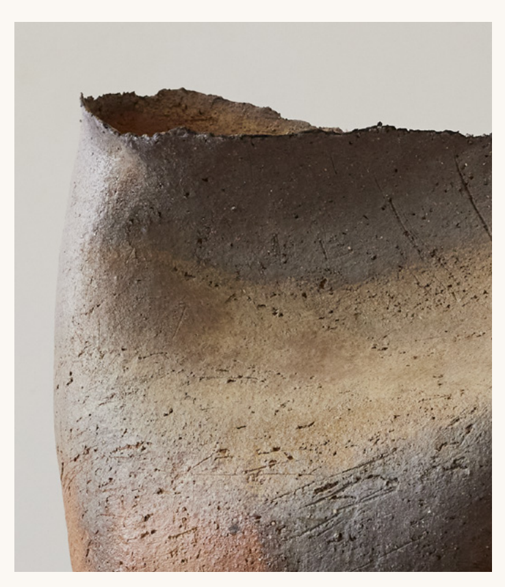
DETAIL, LUDMILLA BALKIS, OLATUA, 2023, WHITE SANDED STONEWARE WITH WOOD ASH SLIP, 21.25"H X 15"W X 17.25"D