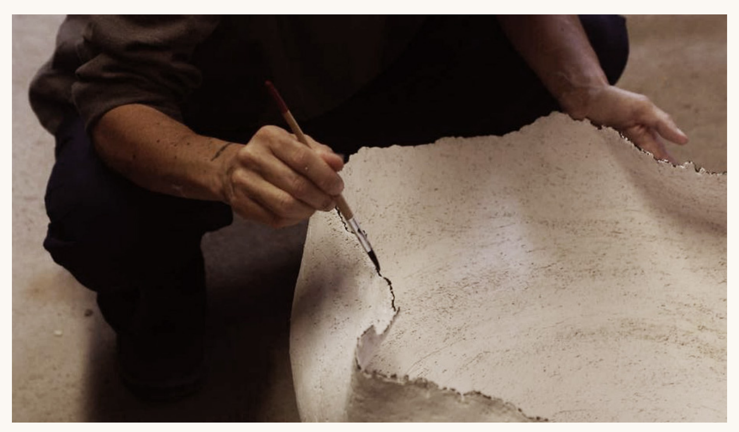
BALKIS GLAZING THE EDGES OF ON THE HEAVENS