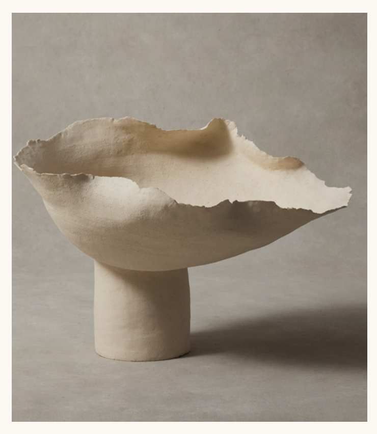
LUDMILLA BALKIS, HODEI, 2023, WHITE SANDED STONEWARE, 20.5"H X 27.5"W X 23.25"D