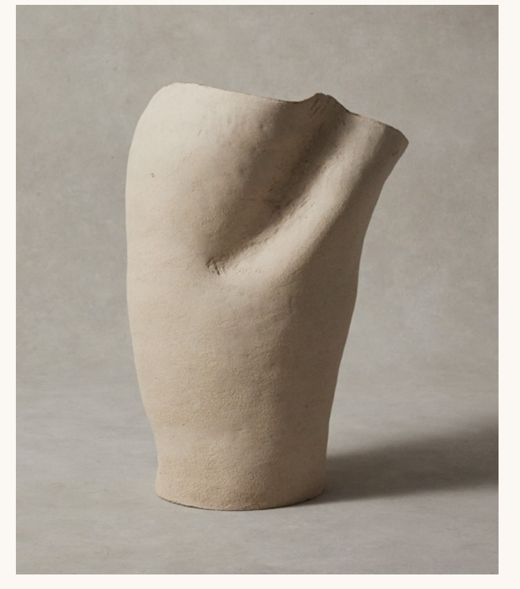
LUDMILLA BALKIS, OREKO, 2023, WHITE SANDED STONEWARE WITH WOOD ASH, 23.5"H X 15.75"W X 11"D