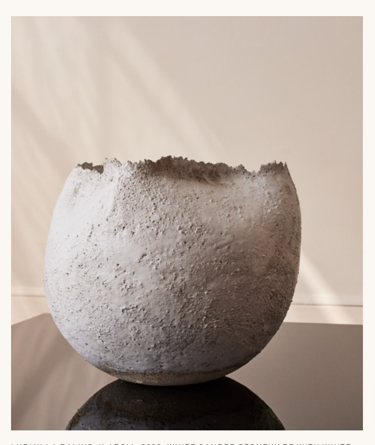
LUDMILLA BALKIS, ILARGIA, 2023, WHITE SANDED STONEWARE WITH WHITE MATTE GLAZE AND BLACK GLAZE PARTIALLY APPLIED TO INTERIOR, 15"H X 18"W X 16"D