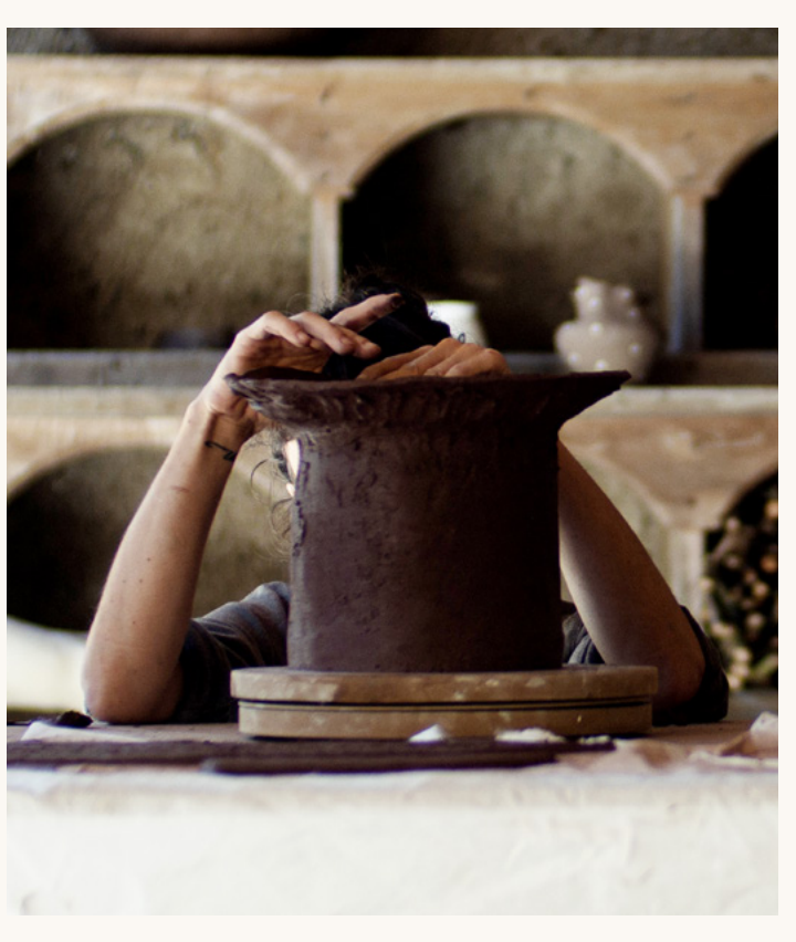
BALKIS FORMING THE EDGES OF THE STONEWARE