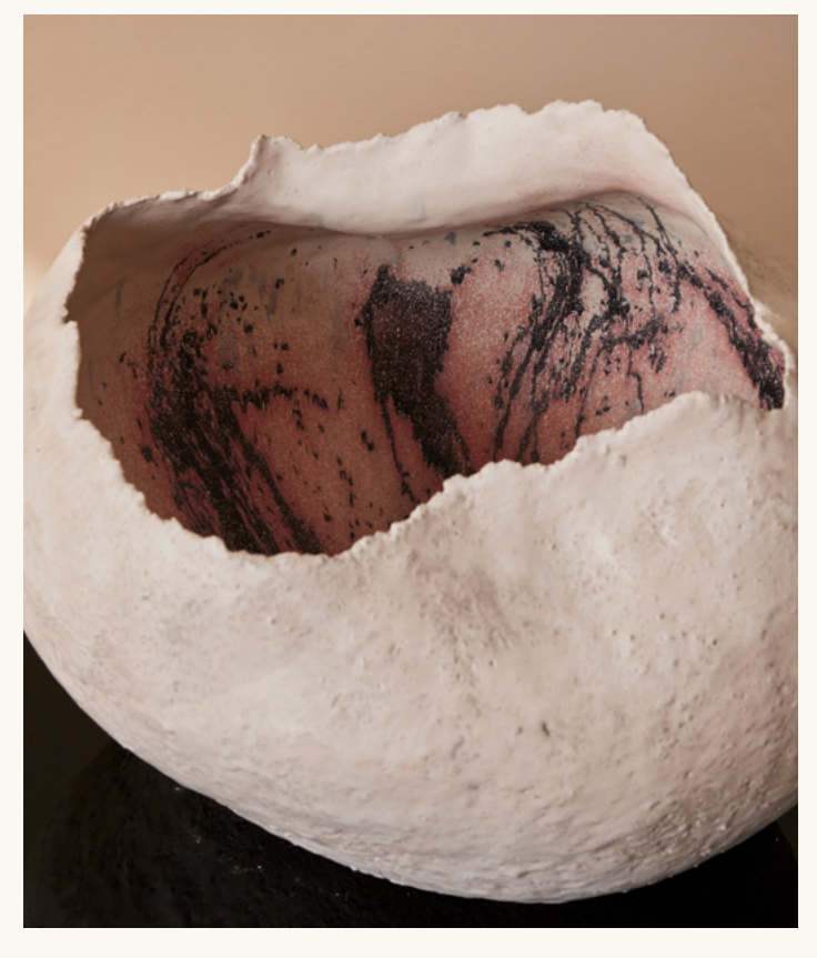
DETAIL, LUDMILLA BALKIS, ILARGIA, 2023, WHITE SANDED STONEWARE WITH WHITE MATTE GLAZE AND BLACK GLAZE PARTIALLY APPLIED TO INTERIOR, 15"H X 18"W X 16"D