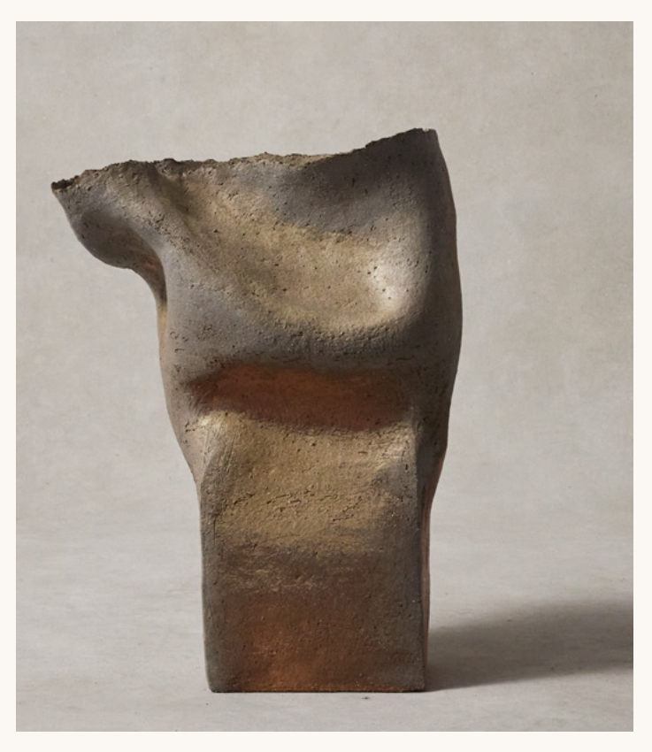
LUDMILLA BALKIS, OLATUA, 2023, WHITE SANDED STONEWARE WITH WOOD ASH SLIP, 21.25"H X 15"W X 17.25"D