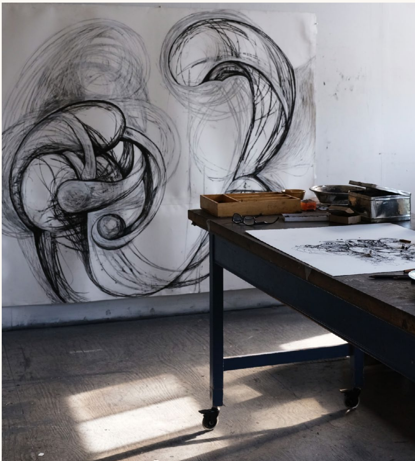
THE LEFT PANEL OF GEER'S TRIPTYCH 'WIND RISING,' 2022, EACH PANEL IS 75"X 60", CHARCOAL, PASTEL, CHALK, PAPER.

THREE TWO ONE CANAL ST NEW YORK, NY 10013