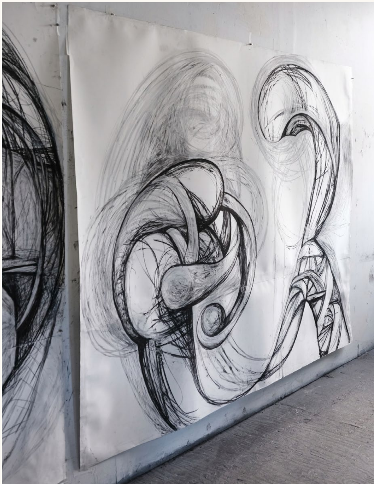
THE LEFT PANEL OF GEER'S TRIPTYCH 'WIND RISING,' 2022, EACH PANEL IS 75"X 60", CHARCOAL, PASTEL, CHALK, PAPER.

THREE TWO ONE CANAL ST NEW YORK, NY 10013