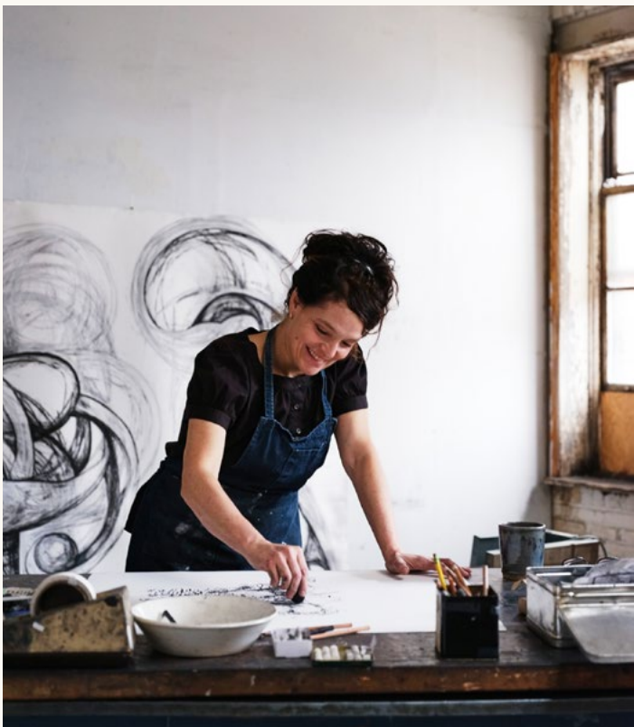
"IT'S LIKE DRAWING TEACHES LOOKING, RATHER THAN THE OTHER WAY AROUND," SAYS GEER.