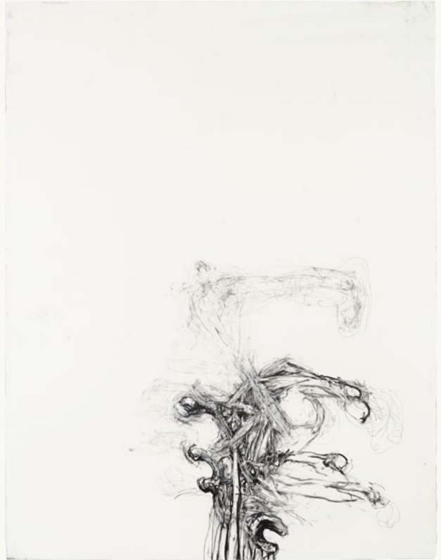
'FIRST BLOOMING', 2021, 38" X 49", CHARCOAL, PASTEL, CHALK, PENCIL, PAPER.