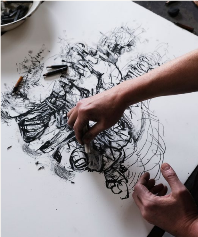
'SMALL CAVERNS,' 2023, 24" X 34", CHARCOAL, PASTEL, CHALK, PAPER.