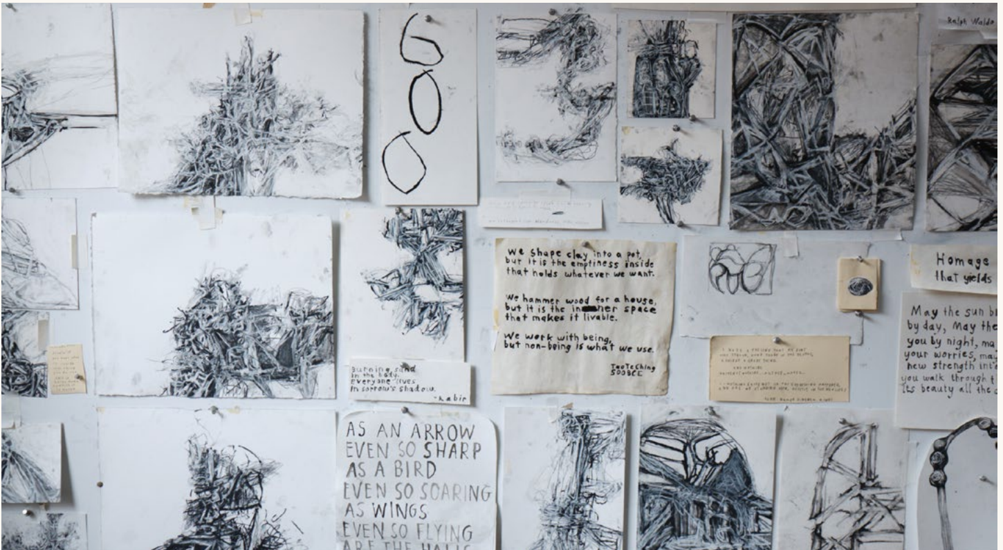
THE WALLS OF GEER'S STUDIO ARE FILLED WITH HER DRAWINGS AND EXCERPTS FROM ANCIENT TEXTS.