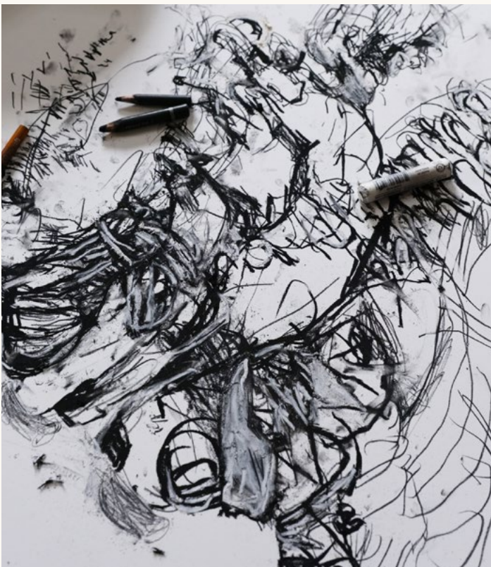
ERASED LINES IN GEER'S DRAWINGS OFTEN CREATE A SENSE OF MOTION.