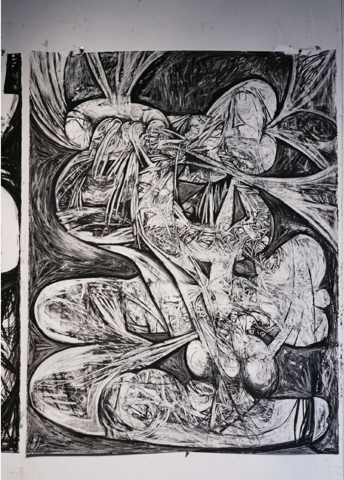
'WATERLOGGED', 2023, 38" X 49", CHARCOAL, PASTEL, CHALK, PENCIL, PAPER.

THREE TWO ONE CANAL ST NEW YORK, NY 10013