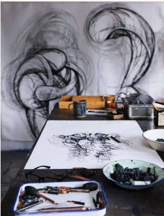
A Geer drawing in process.

This unspooling night field is the closest I get to describing the content of my work. Parts unseal themselves from their objects and ride into the drawings as if on horseback. The more I draw, the more the drawing clamors at me. I have to draw towards the bits I can make out before they disappear. Tracks of barely visible lines, thick, tangling blackness, booming pressure. I am not sure what I am drawing. But I feel I can't draw fast enough to get the lines all down.