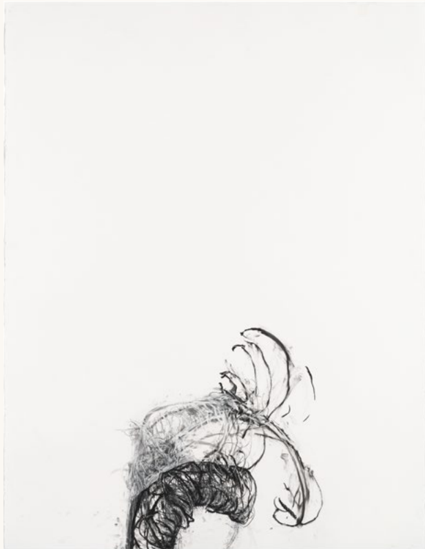
'LITTLE HUMBACK', 2021, 38" X 49", CHARCOAL, PASTEL, CHALK, PENCIL, PAPER.