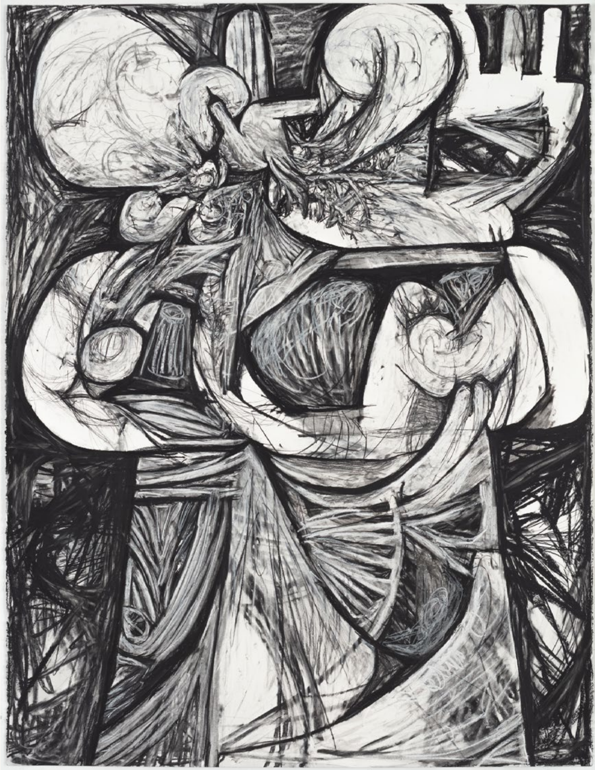
'CAPITOL', 2023, 38" X 49", CHARCOAL, PASTEL, CHALK, PENCIL, PAPER.

THREE TWO ONE CANAL ST NEW YORK, NY 10013