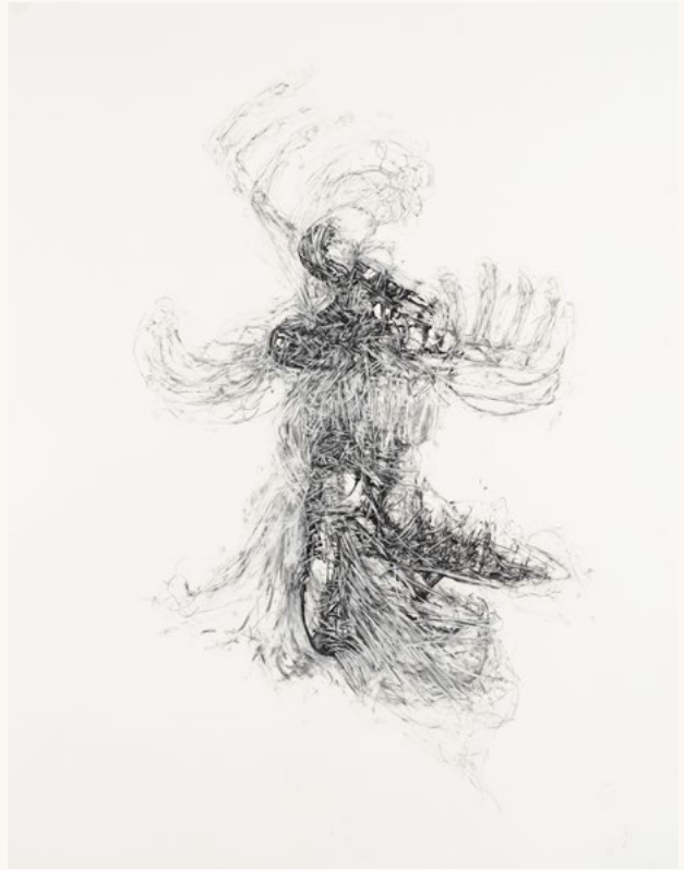
'HOVERING BACH', 2021, 38" X 49", CHARCOAL, PASTEL, CHALK, PENCIL, PAPER.