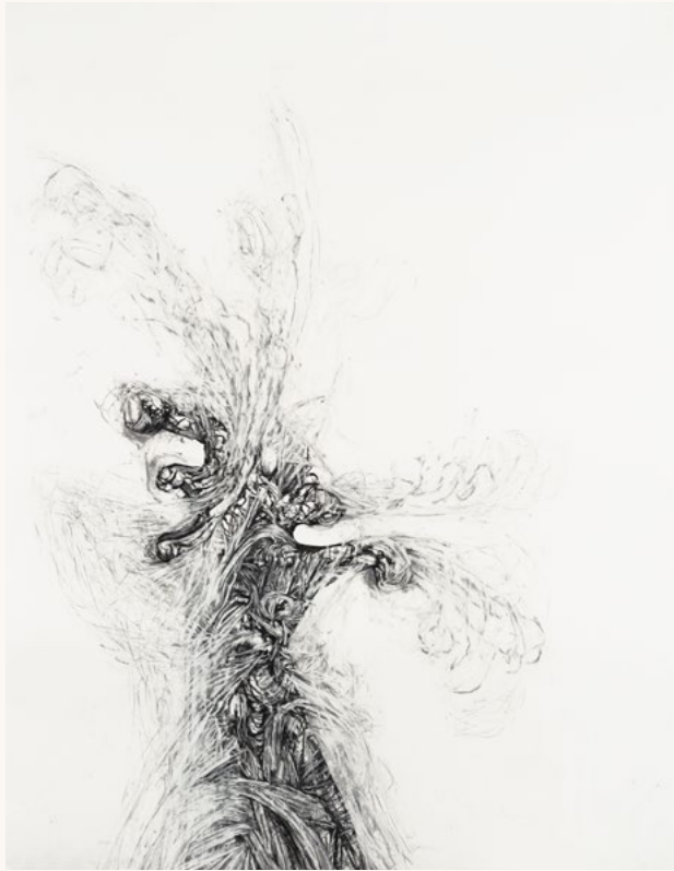
'EL JALEO', 2021, 38" X 49", CHARCOAL, PASTEL, CHALK, PENCIL, PAPER.