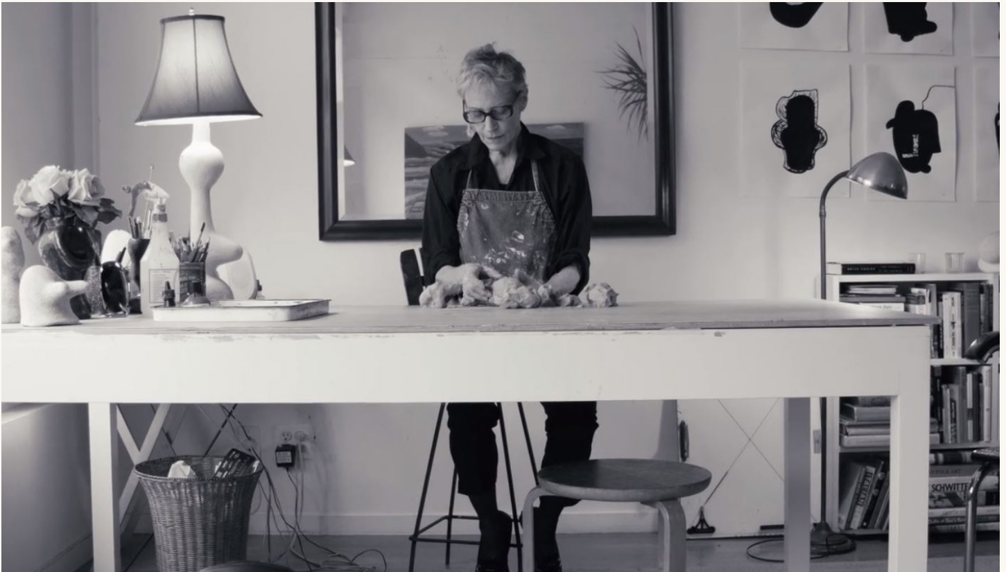
STARTING EACH PIECE WITH A SKETCH, WELLS THEN USES A COILING TECHNIQUE IMBUED WITH THE HUMAN TOUCH FOR AN EFFECT THAT IS PLAYFUL AND INTENTIONALLY UNREFINED.