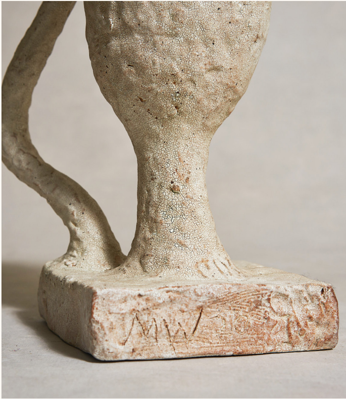
DETAIL, URN WITH CROOKED HANDLE, 2019, GLAZED CERAMIC, 13.4"H X 6.7"D