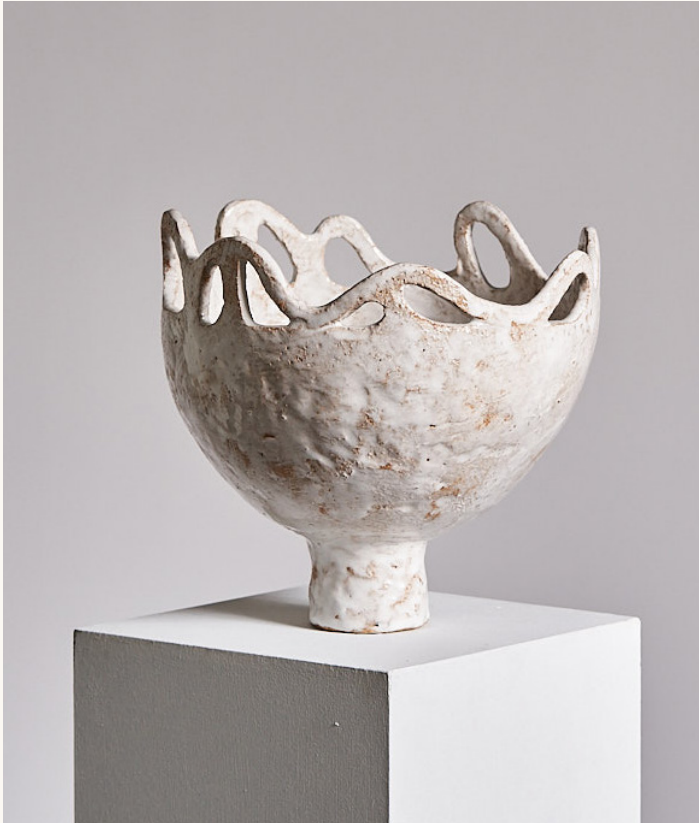
BOWL WITH CURVY TOP, 2021, 8.5"H X 9"D