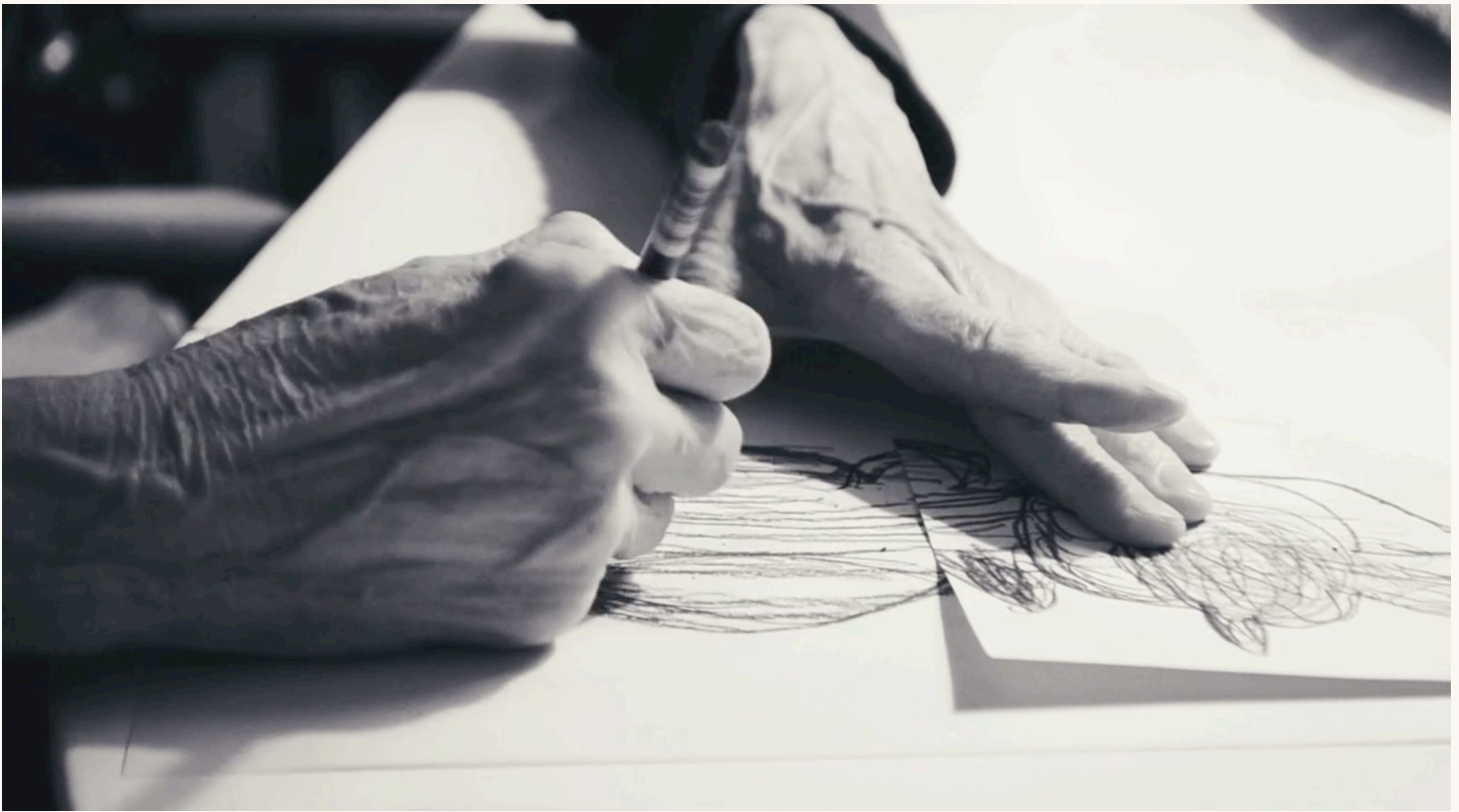
WELLS STARTS EACH PIECE WITH A SKETCH, SOMETIMES LAYERING MULTIPLE SKETCHES TO FIND THE RIGHT COMPOSITION.