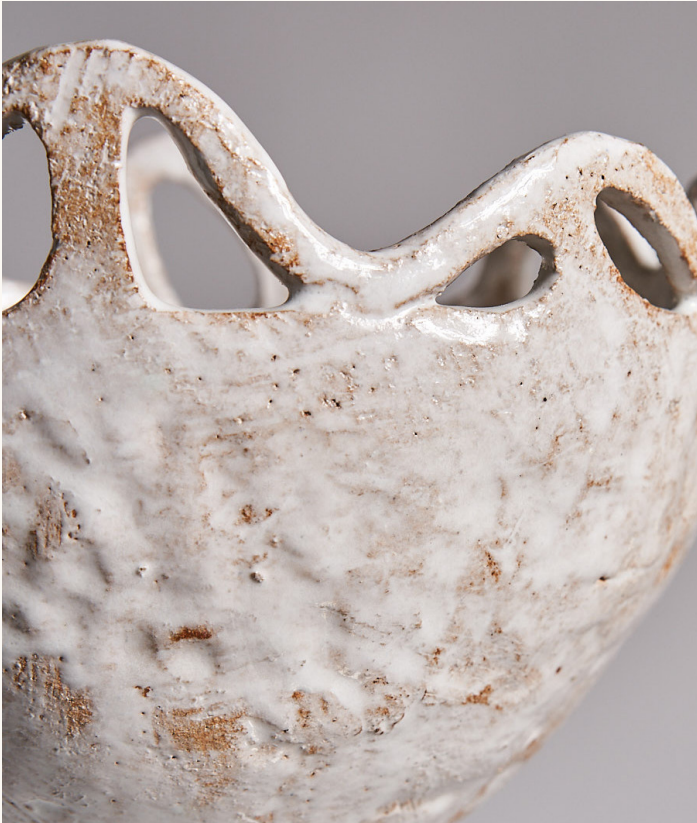
DETAIL, BOWL WITH CURVY TOP, 2021, 8.5"H X 9"D