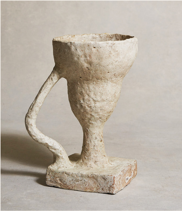
URN WITH CROOKED HANDLE, 2019, GLAZED CERAMIC, 13.4"H X 6.7"D