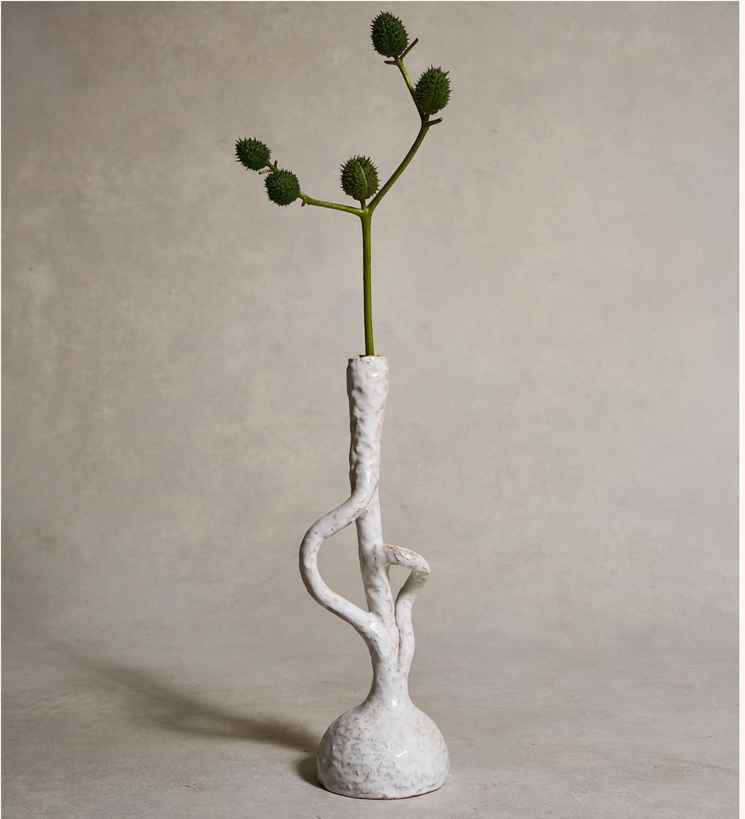
CURVY CANDLE HOLDER, 2021, GLAZED CERAMIC, 16" H X 5" D

THREE TWO ONE CANAL ST NEW YORK, NY 10013