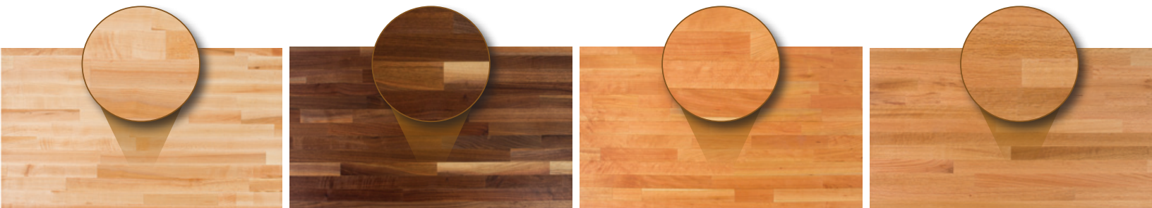
Northern Hard Rock Maple