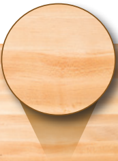
Northern Hard Rock Maple

The Boos® Extra 1" Edge: All Boos® counter tops in standard lengths of 8' or longer are manufactured with 1" added to the length. This is another exclusive Boos® bonus offering for fabricating a long block into two shorter blocks, allowing room for the saw cut, yet maintaining the full length of both block requirements.