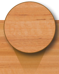
Appalachian Red Oak