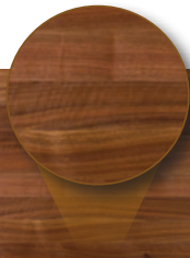
American Black Walnut (Standard 2-3 finger joint per interior rail on 8' or longer Walnut KCT.)