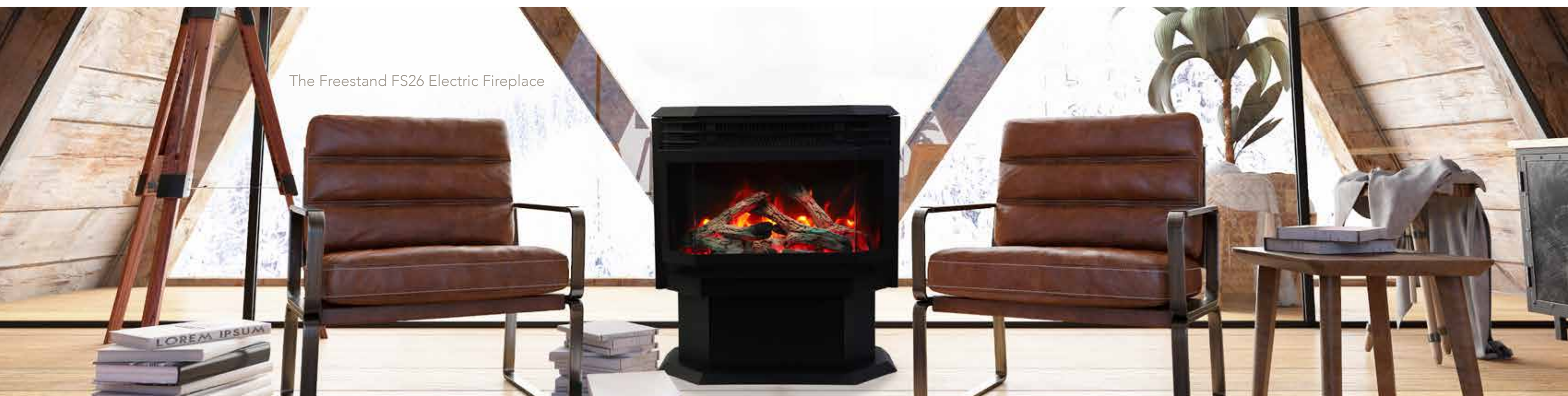
The Freestand FS26 Electric Fireplace

*Manufacturer guidelines regarding outdoor installation must be followed. Please refer to the owner's manual for additional information