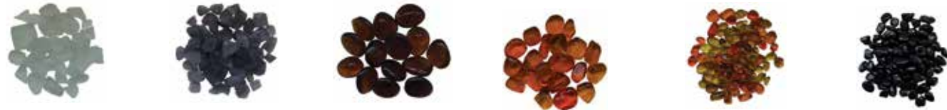
AMSF-GLASS-13 AMSF-GLASS-14 AMSF-GLASS-15 AMSF-GLASS-16 FI-105-DIAMOND