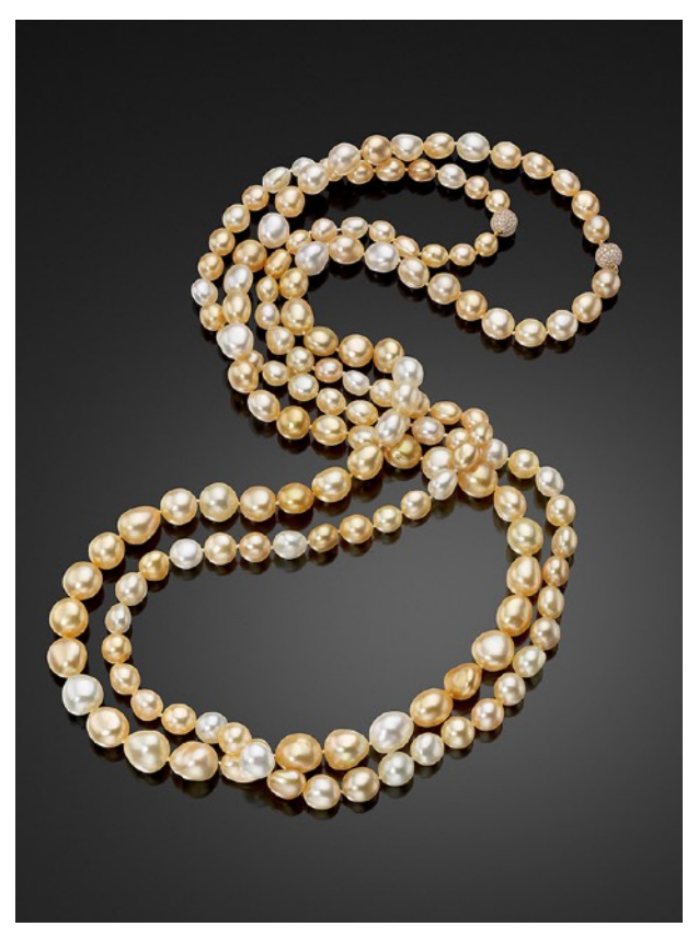
Rare golden nonbead cultured pearls also known in the trade as golden keshi cultured pearls

This short-duration live format in an online room with limited seats is learning-friendly as it promotes engagement with the tutor and colleagues in a dynamic and relaxed environment.