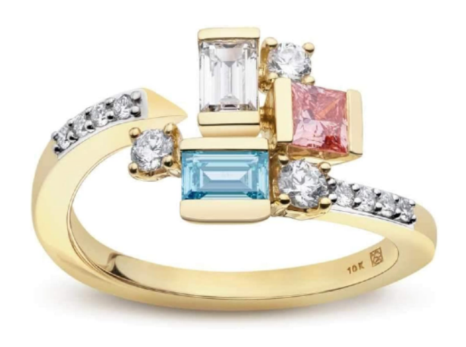
A selection of loose and set CVD-grown colourless and coloured synthetic diamonds grown by De Beers