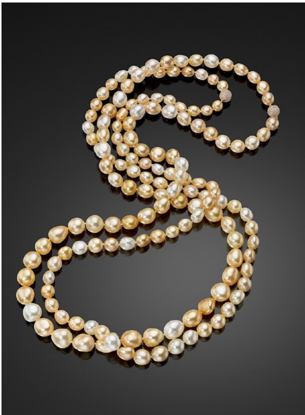
Rare golden nonbead cultured pearls also known in the trade as golden keshi cultured pearls

This short-duration live format in an online room with limited seats is learning-friendly as it promotes engagement with the tutor and colleagues in a dynamic and relaxed environment.