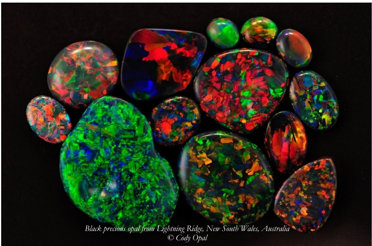
Black precious opal from Lightning Ridge, New South Wales, Australia