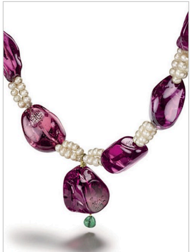
The pink to red spinels from the Pamir mountains were historically known as "Balas rubies"