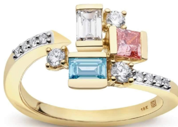
A selection of loose and set CVD-grown colourless and coloured synthetic diamonds grown by De Beers