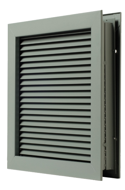
Designed for Use on 134" Thick Doors Manufactured Within Door Industry Tolerance of +/- ½6".