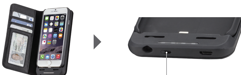
Actual folio style may vary

When your iPhone battery is low, turn on charging mode with the power switch located at the base of the battery dock. Make sure your iPhone is secured in the slim case and the case is situated properly in the battery dock with the lightning connector securely inserted into the bottom of the iPhone. It is recommended to turn on charging mode when your iPhone battery becomes low (20% or less). The iPhone requires more power when it is constantly being charged, so you will see better results from the folio battery if you wait to charge when your iPhone battery is low. If your iPhone is fully charged when charging mode is turned on, then the battery dock will act as your primary iPhone battery until it has been depleted.