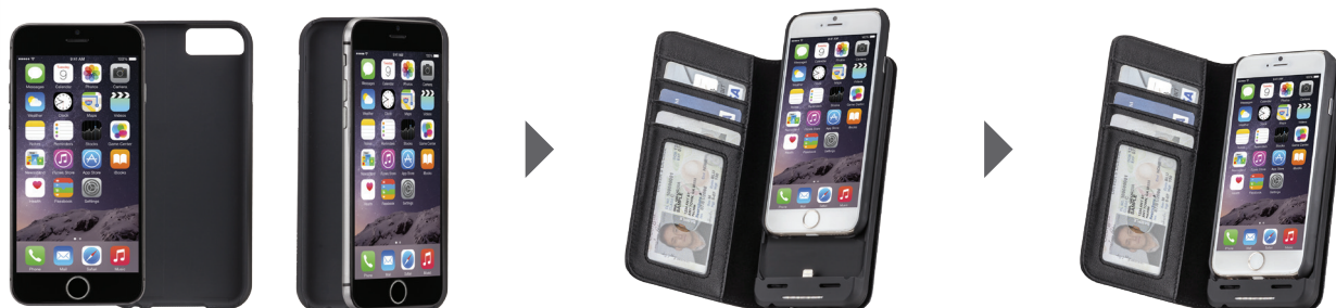
Actual folio style may vary

NOTE: You will need to remove the case or slide the case upward from the battery dock to use the iPhone camera and to insert headphones. When using headphones, slide the case upward and pull the headphone connector through the hole at the bottom of the battery dock. Plug the headphones into the iPhone and push the case securely back down into the battery dock.