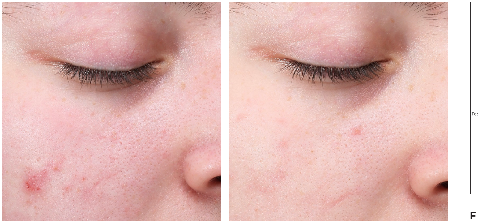
FIGURE 1: Visual improvements from baseline to week 8.