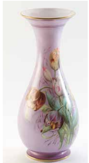
Blown Opal Vase Decorated with Tulips. Attributed to the Boston & Sandwich Glass Company, 1875-1887. Acc. No. 2004.15.45.