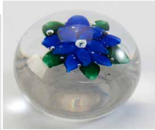
Poinsettia Paperweight. Attributed to the Boston & Sandwich Glass Company, 1876-1887. Acc. No. 2005.14.1.