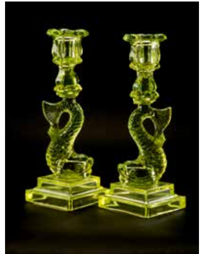
Pressed Canary Dolphin Candlesticks. Attributed to the Boston & Sandwich Glass Company, 1845-1870. Acc. No. H.1.27.1