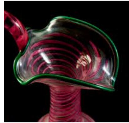
Framework Whimsey. Attributed to the Boston & Sandwich Glass Company, 1885. Acc. No. 1957.5.1.