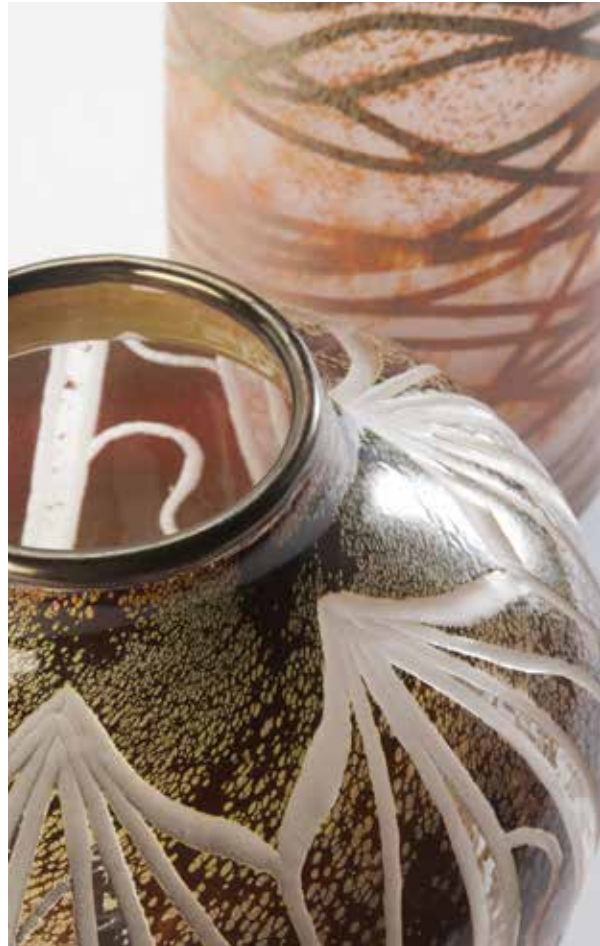
Top right: Trevaize Vase. Attributed to the Alton Manufacturing Company, Sandwich, 1907. Acc. No. 1991.22.