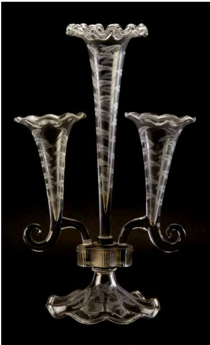
Blown and Engraved Epergne. Attributed to the Boston & Sandwich Glass Company, 1875-1887. Acc. No. 1924.37

“Sometimes a deadline is the best way to learn something new. I wandered through the Museum in search of inspiration. What a great chance to step away from the simple shapes and complex color designs that my work embodies. Finding pieces that inspired me was easier than I thought. There were bottles and bowls, but they didn’t have the sculptural aspect I was looking for. Then there were the epergnes, an ornamental center piece with multiple components. What a challenge that would be. Images started floating around in my head. Mermaids were something I’ve wanted to try for a while now, so an aquatic theme was in the works. With a lot of practice and some hands on troubleshooting my epergne was slowly created.”