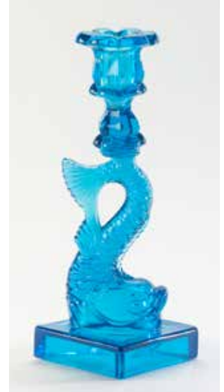
Pressed Single Step Dolphin Candlestick. Attributed to the Boston & Sandwich Glass Company, 1845-1870. Acc. No. 1939.2.1