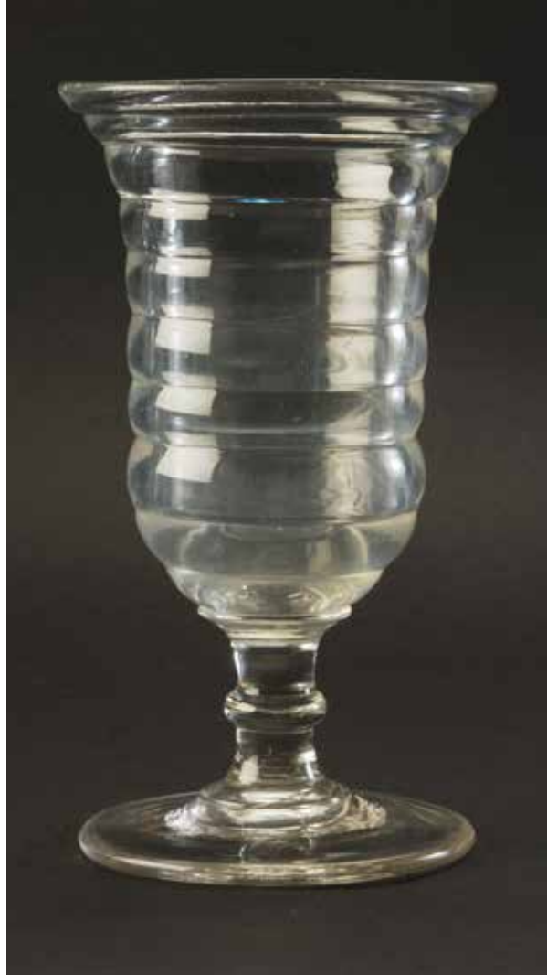
Blown Beehive Celery Vase. Attributed to the Boston & Sandwich Glass Company, 1828-1835. Acc. No. 1990.77

Embracing the past and working from one or more reference points without trying to impose more than my own experiences, particularly as a child, is what glass captured in me when I first started working with it. After all, who can forget the jelly jar full of milk afterschool or the armoire with glass passed down through the generations.”