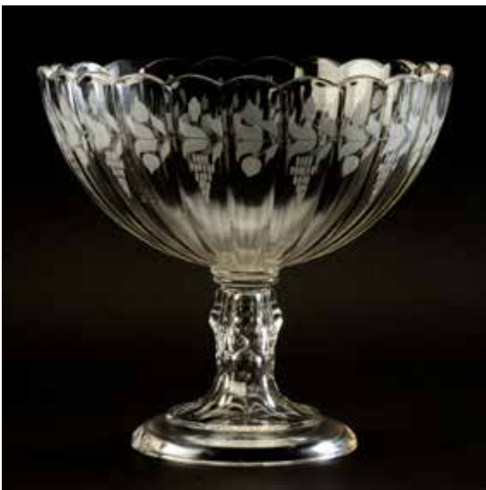
Pressed Huber Pattern Compote Attributed to the Boston & Sandwich Glass Company & Others, 1855-1875. Acc. No. 1963.9.15.

Object making is a wonderful way to celebrate the beauty described by nature, while it also serves me as a powerful spacial forum, helping to cerebrate the questions paramount to Earth’s future health.”