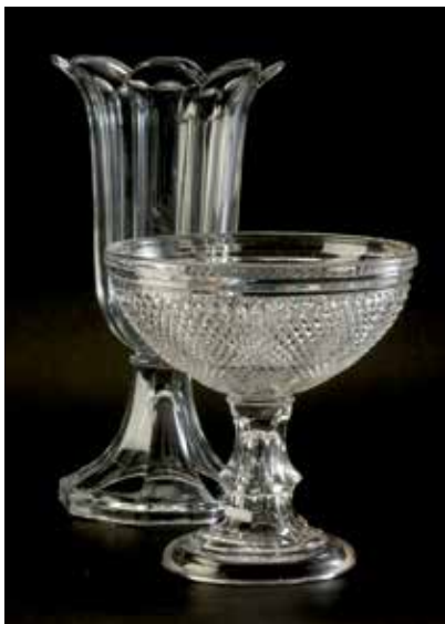
Pressed Tulip Vase with Octagonal Base Attributed to the Boston & Sandwich Glass Company, 1845-1865. Acc. No. 1974.151