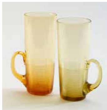
Blown Amber Threaded Lemonade. Attributed to the Boston & Sandwich Glass Company, 1880-1887. Acc. No. 1997.025

Discovering new methods of capturing the translucency of glass and color are what drive my work; inspiration comes from my gardens, the ever-changing light on the ocean and seascapes that surround me. Using multi-layered colors mixed with pure metals helps me create miniature wearable sculptures of understated elegance that are tactile and beautiful.”