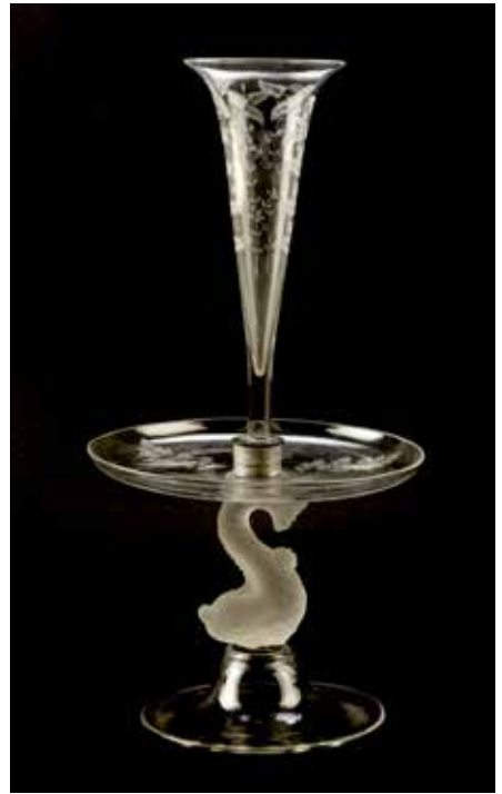
Blown, Engraved, and Pressed Dolphin Epergne. Attributed to the Boston & Sandwich Glass Company, 1870- 1877. Acc. No. 1969.18.1.