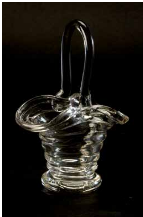
Blown Beehive Basket. Attributed to the Boston & Sandwich Glass Company, 1840. Acc. No. 1991.063

Inspiration comes from all around; the light in a cloud streaked sky, the striations of color in a mountain range, the shapes of leaves and flowers in a garden. With these images in mind I apply multiple layers of color to my work. When someone picks up one of my beads, looks at it and says they can imagine what it would feel like to be on the inside—then I know I have accomplished what I set out to do!”