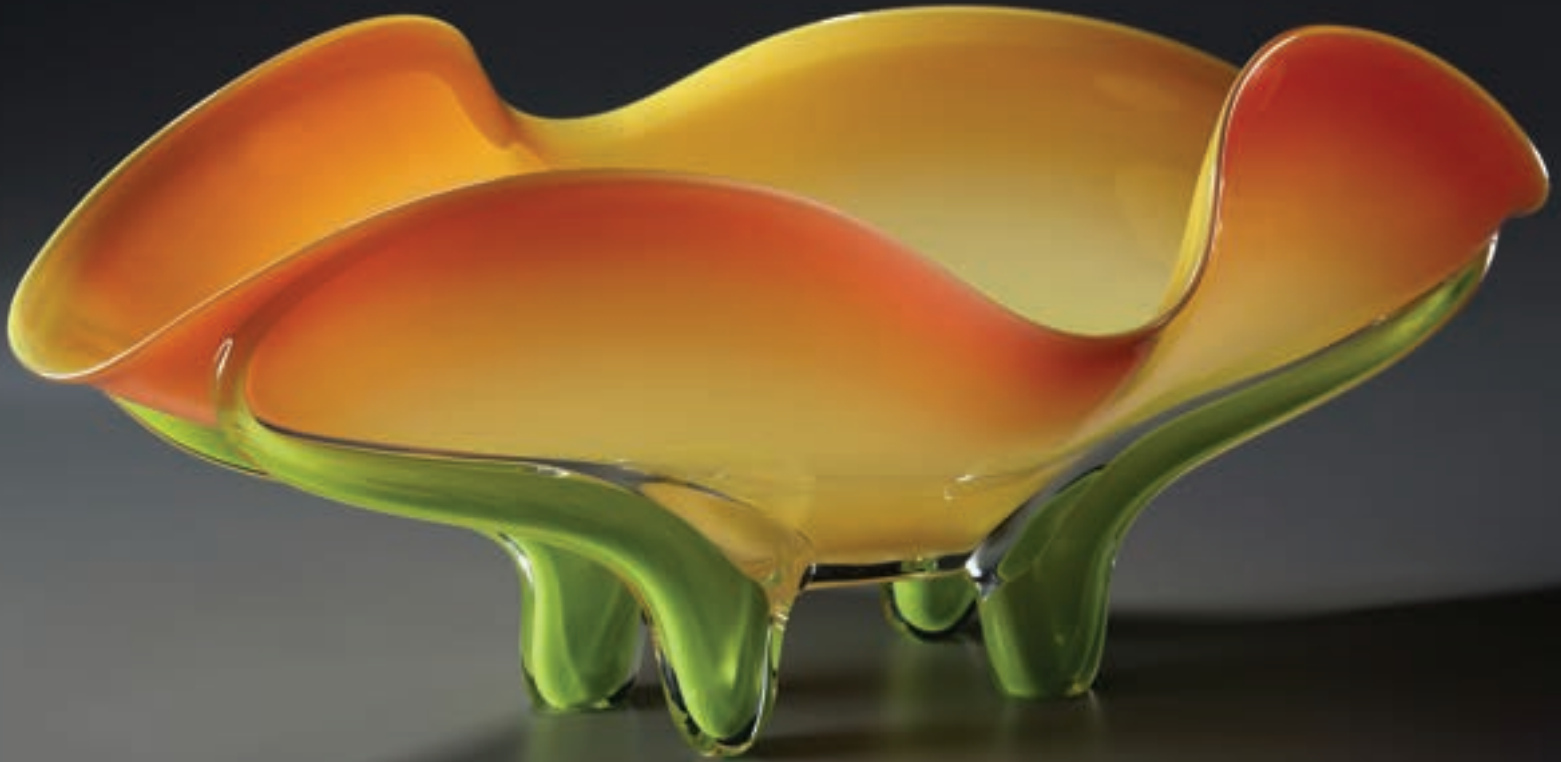
Yellow Ember Tropical Bowl