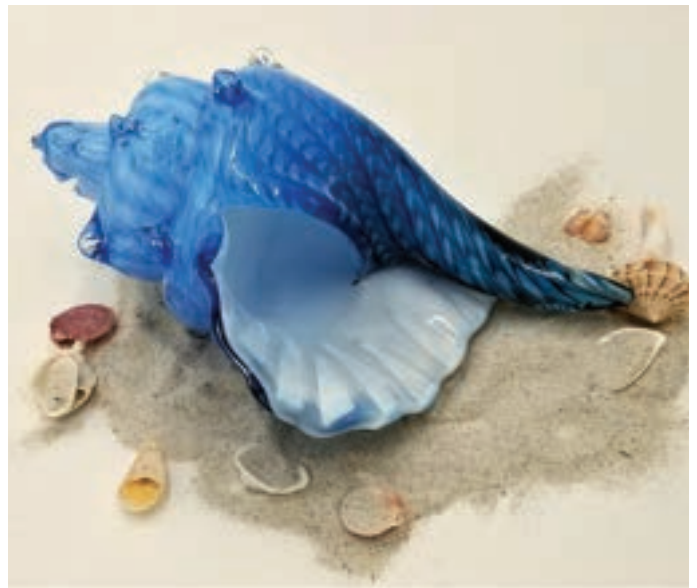
Above: Shell by David McDermott.

The sea is an integral part of Sandwich and that is what makes it such a very special place. On Saturday, May 20 ( rain date Sunday, May 21 ), 10 am – 2 pm, we will hold our 5th Annual SeaFair celebration of sea-inspired glass. Sea creatures, waves, mermaids, beaches, shells, and the like will be specially curated for this unique and popular sale. All these artistic creations are designed by the region's talented glass artists, just perfect for an "ocean memory" gift or to add to your collection! Our 5th Annual SeaFair will be located on the grounds of the Sandwich Glass Museum.