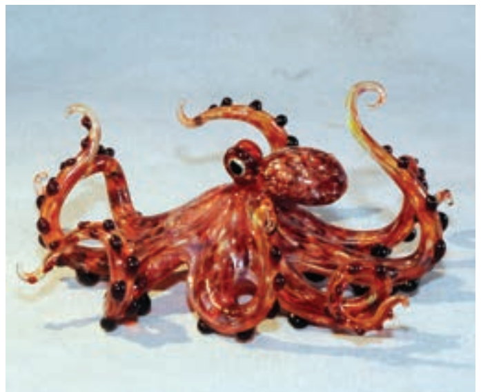
Below: Octopus by Isabel Green.