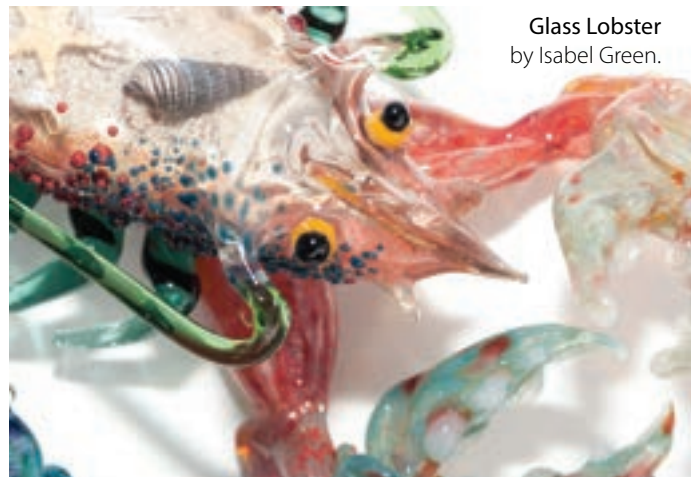
Glass Lobster by Isabel Green.

On Saturday, July 29 (rain date Sunday, July 30), 9:30 am – 2 pm, the Sandwich Glass Museum launches its 1st Annual Glass Bazaar , a summer celebration of glass art, highlighting items from the many talented regional artists exhibited in the Museum. This will be an outdoor, tented event; a great activity to share with friends and family!