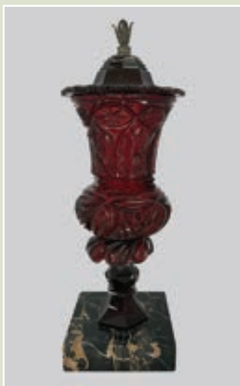
Cover and above: Probably Cape Cod Glass Company Cut Covered Urn, Bohemian Style. Displayed at the International Exhibition in Paris, France 1867.