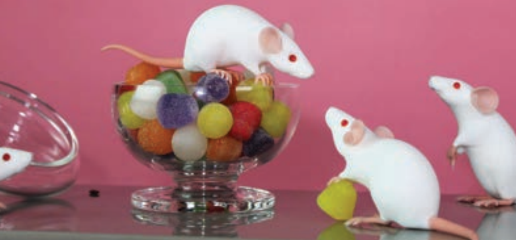
Dish by Caterina Urrata Weintraub

C reatures Great and Small celebrates the talents of four East Coast based artists working in glass, each with their own charming whimsical and beautifully executed glass sculptures, celebrating the beauty and magical characteristics of the creatures, flora and fauna filling our natural world.