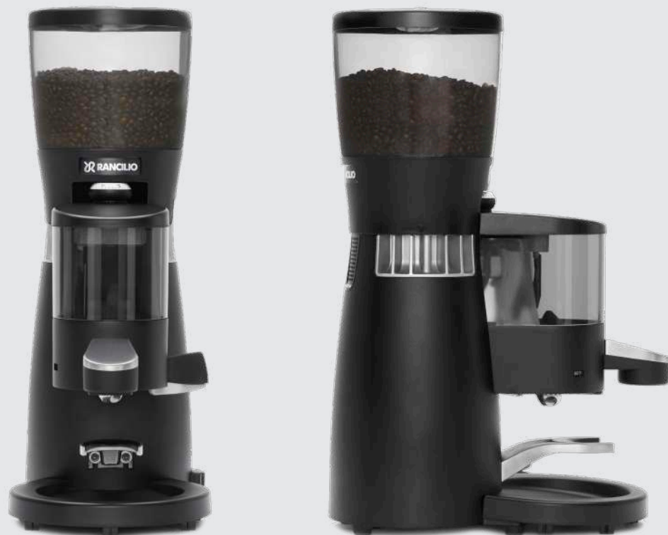
KRYO 65 AT / 65 ST