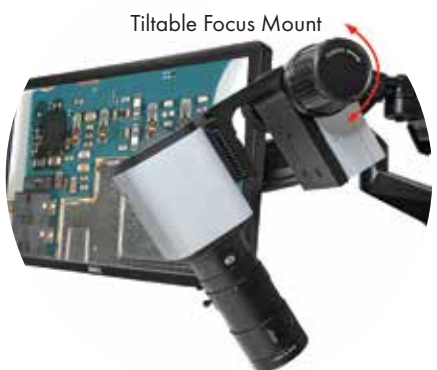
Tiltable Focus Mount