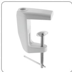
Heavy Duty Mounting Clamp