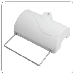
Weighted Table Base Item # 26501-WB