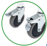
Smooth running castors

Side rails on all three sides, top and bottom