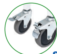
95mm Smooth running castors