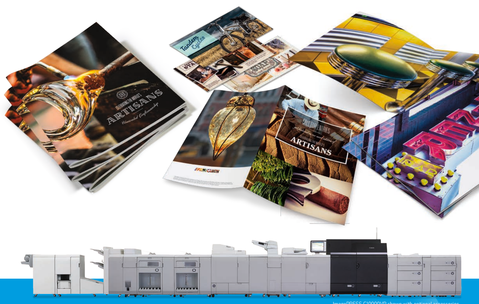
imagePRESS C10000VP shown with optional accessories.