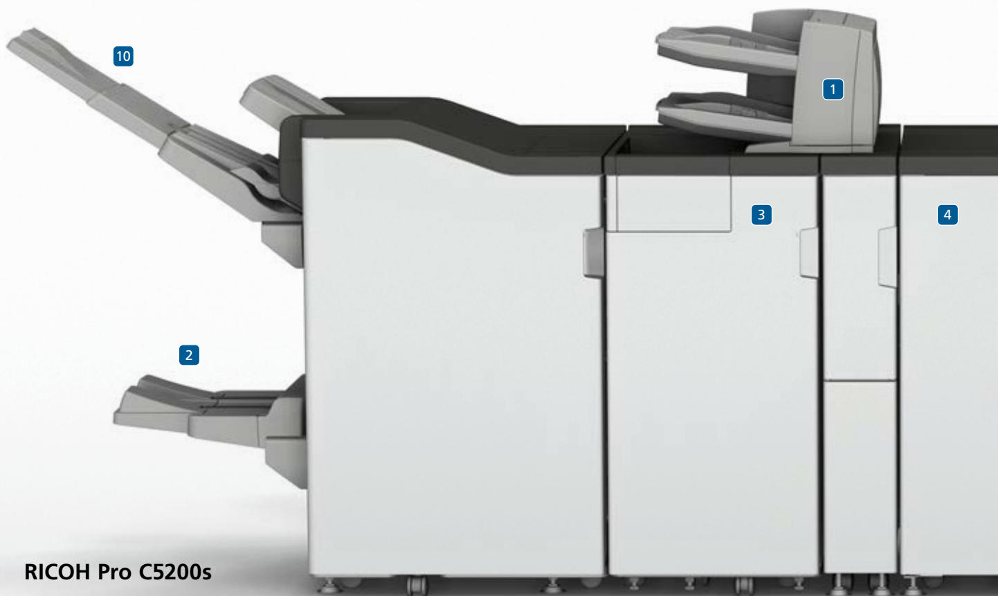
RICOH Pro C5200s