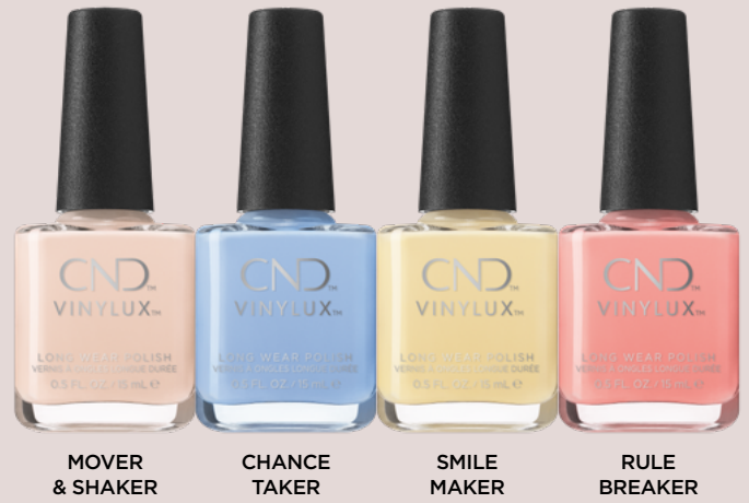
MOVER & SHAKER