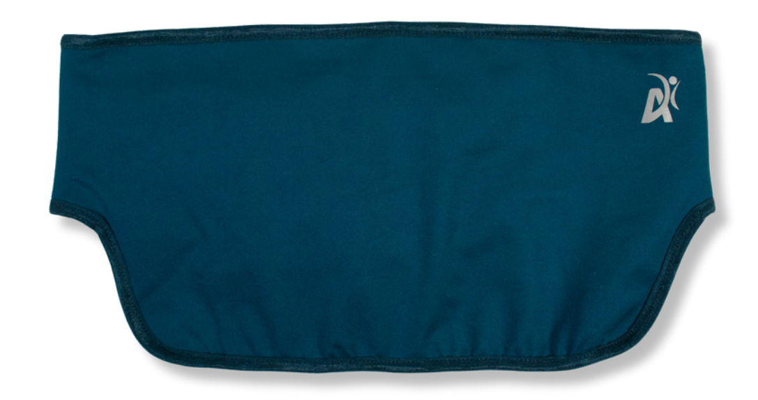
Low Profile - ($75.99) Pouch coverage and support