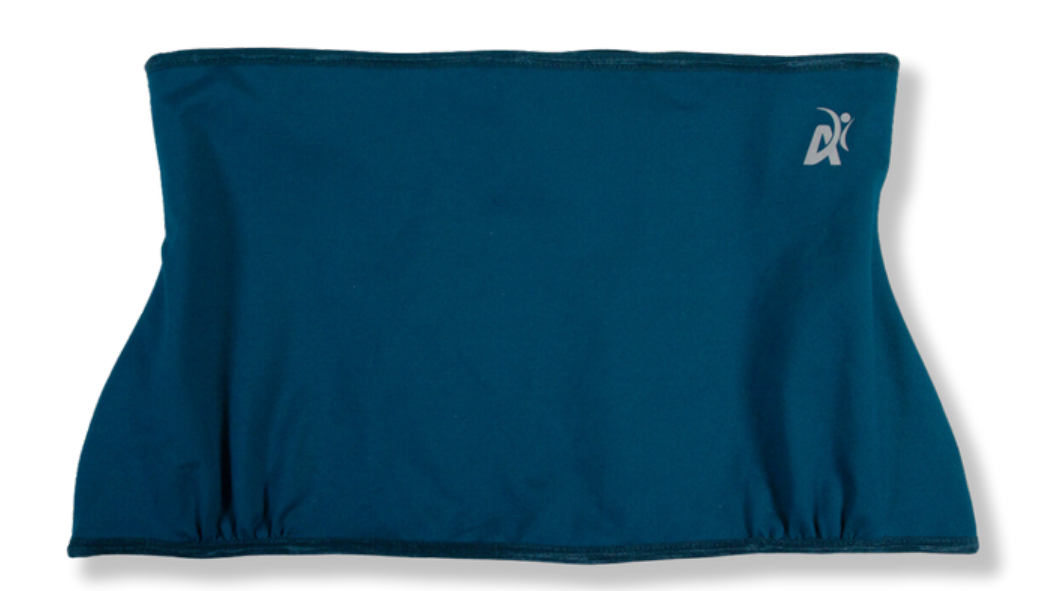
High Profile - ($85.99) Full coverage and hernia support