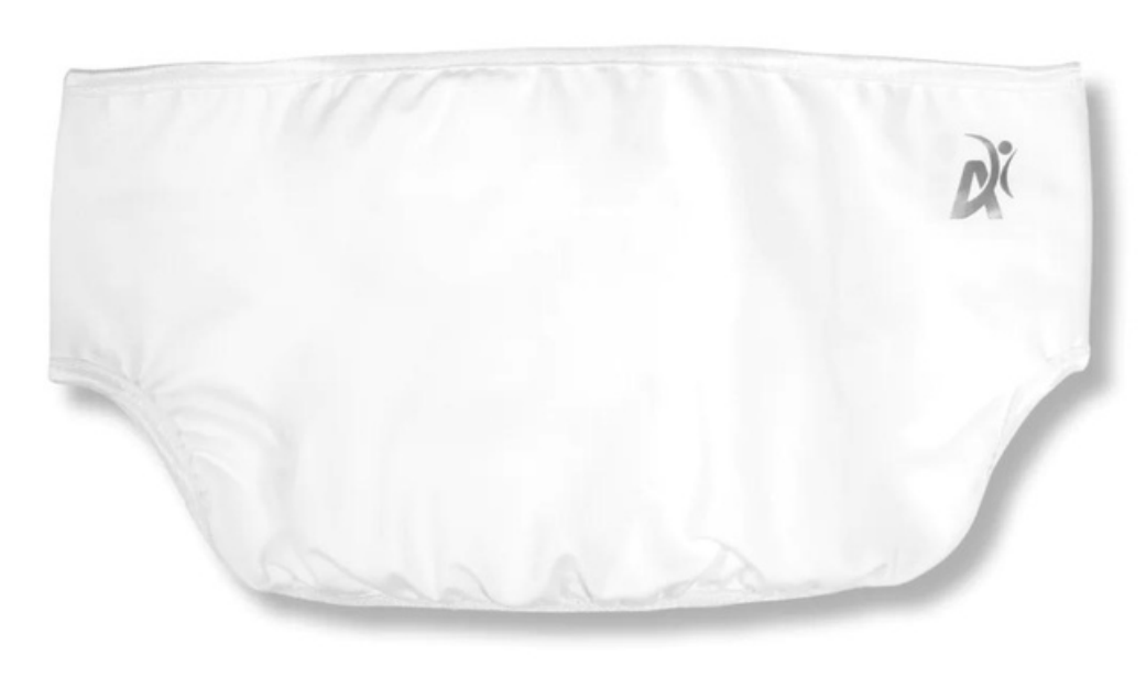
Low Profile - ($75.99) Pouch coverage and support