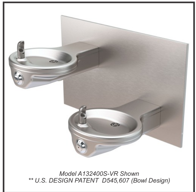
Model A132400S-VR Shown ** U.S. DESIGN PATENT D545,607 (Bowl Design)