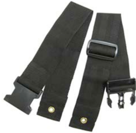
Model #: SB22