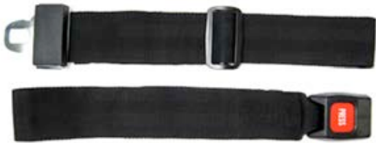
Model #: SB99-48