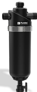
Irrigation filter housing (super)