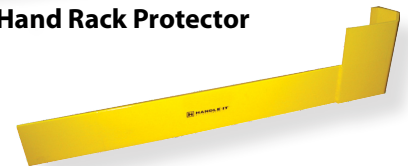
Right Hand Rack Protector