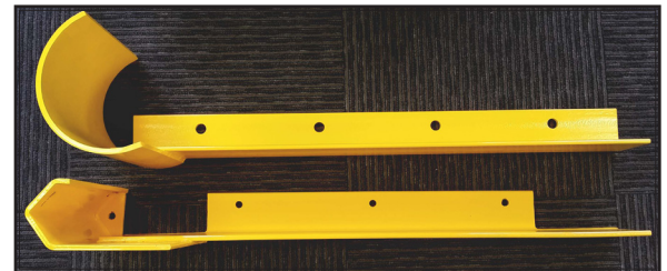
Standard Rack Protector vs. Space Saving profile