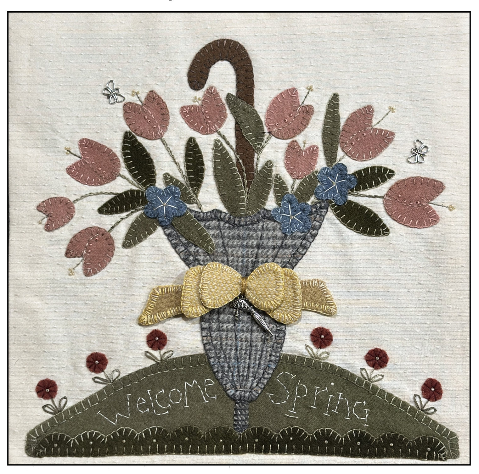
Debbie Busby ©Wooden Spool Designs