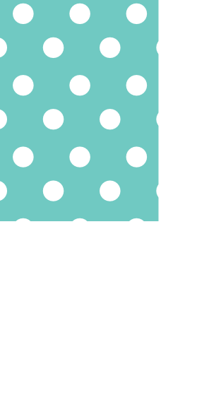
What traits do your Mom and children share?