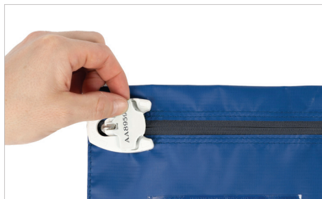
Step 3: Press seal into locking mechanism to secure contents