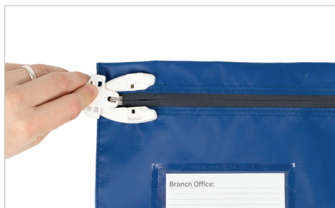
Step 1: Pull zip puller across