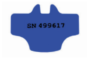
Numbered T2 Security Seals

The T2 is Versapak's premium security seal, and it provides the ultimate in tamper evident security. It is 100% recyclable, and is antimicrobial. It is available in a range of colours and has a large surface area that's suitable for barcodes, branding, numbering, or QR Codes.