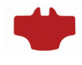
Plain T2 Security Seals