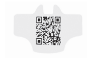
QR T2 Security Seals