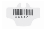
Barcoded T2 Security Seals