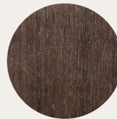
Burnished Walnut Frame