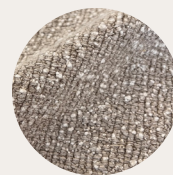
Textured Fabric Seat