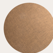
Antique Brass Detail