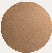
Antique Brass Detail