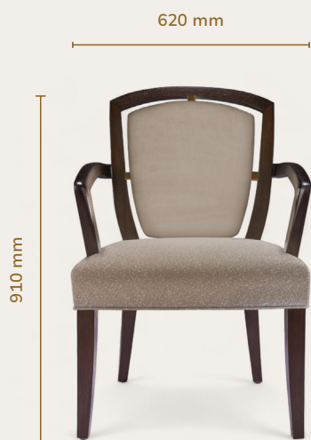
Carver Size 1