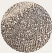
Textured Fabric Seat