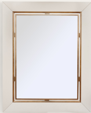
Crossley Mirror, Ivory