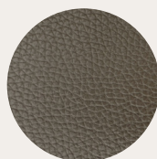
Bronze Faux Leather Frame