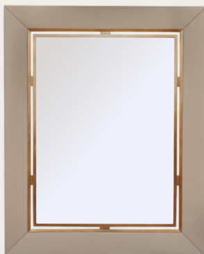
Crossley Mirror, Taupe