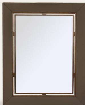
Crossley Mirror, Bronze