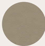
Taupe Faux Leather Frame