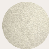
Ivory Faux Leather Frame