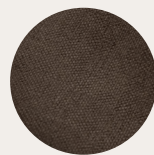
Albany Back rest & seat base