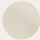
Grange Seat pad