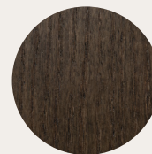
Wood Legs & back panel