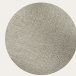
Albany Back rest & seat base