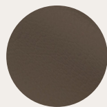
Burghley Seat pad