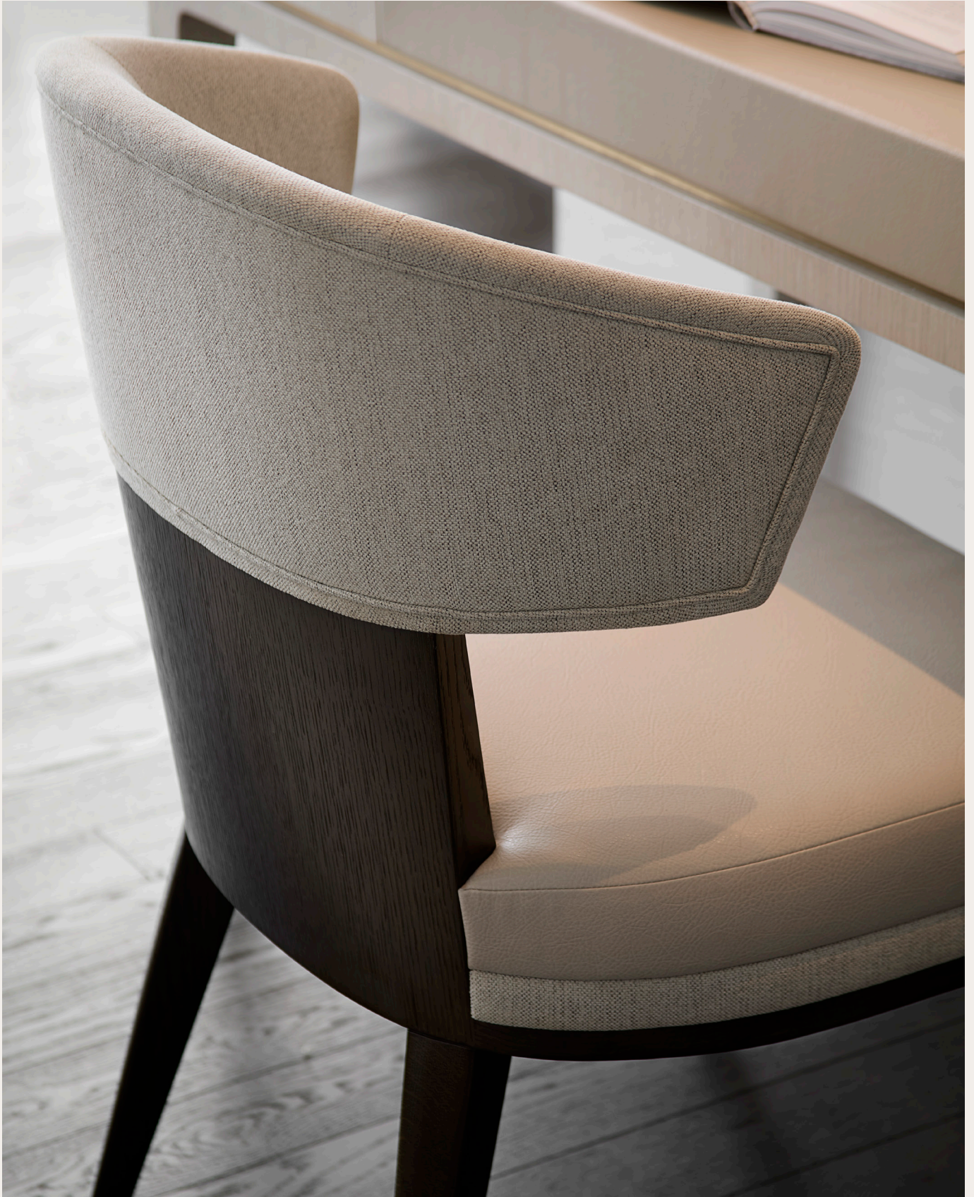
ABEL DINING CHAIR Contemporary Furniture Collection