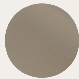
Holme Seat pad