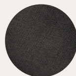
Albany Back rest & seat base