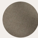
Albany Back rest & seat base