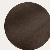
Textured Fabric Back rest & seat base