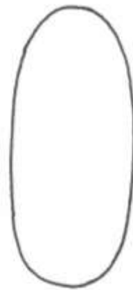
BODY Cut (2) from Ash felt

Cut around rectangle. Cut out holes and attach brooch for Mother's Day card.