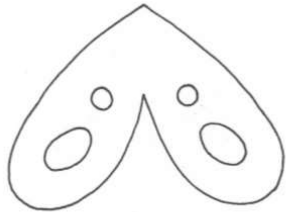
TOP WING Cut (1)