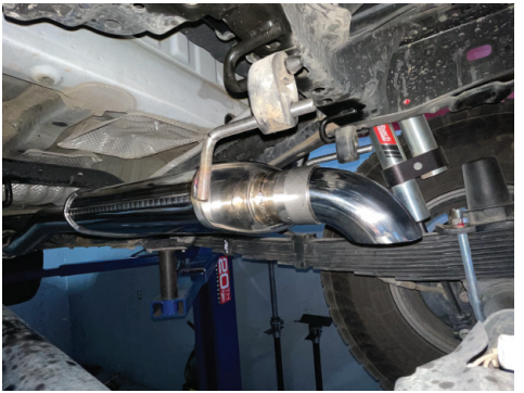
11. Secure the HT-Rear pipe to the muffler section using the 76mm clamps. Once complete, ensure all bolts and clamps are properly secured.