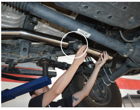
the front extension pipe to the front pipe. Secure using the provided 76mm clamps