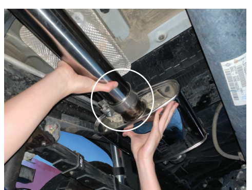
10. Secure the muffler section to the front pipe with the provided 76mm clamps.

CONGRATULATIONS! You have just completed the installation of this exhaust system. Periodically, check the alignment of the exhaust, normal wear and tear can cause nuts and bolts to come loose. Note: Check clearance and adjust if needed! Failure to check the alignment and adjust the exhaust can cause damage that will void the warranty. Injen Technology is not responsible for any damages caused by/from improper installation.