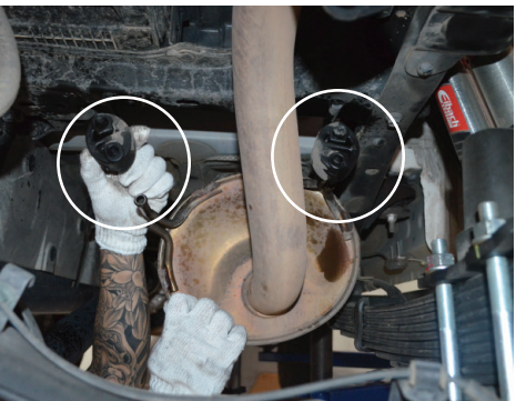
2. Detach the three muffler hangers from the rubber insulators.