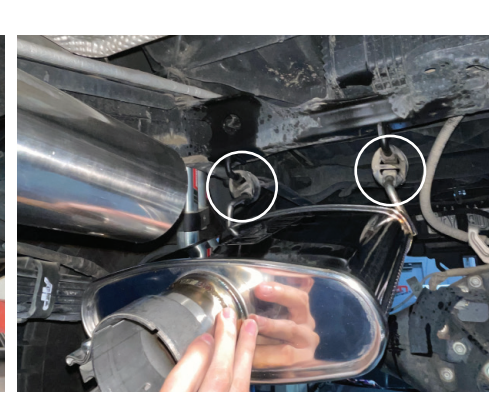
8. DOUBLE CAB LONG BEDS ONLY: Attach 9. Insert the muffler hangers into the rubber insulators.

CONGRATULATIONS! You have just completed the installation of this exhaust system. Periodically, check the alignment of the exhaust, normal wear and tear can cause nuts and bolts to come loose. Note: Check clearance and adjust if needed! Failure to check the alignment and adjust the exhaust can cause damage that will void the warranty. Injen Technology is not responsible for any damages caused by/from improper installation.