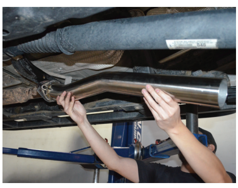
6. Attach the Injen front pipe to the OEM exhaust pipe.