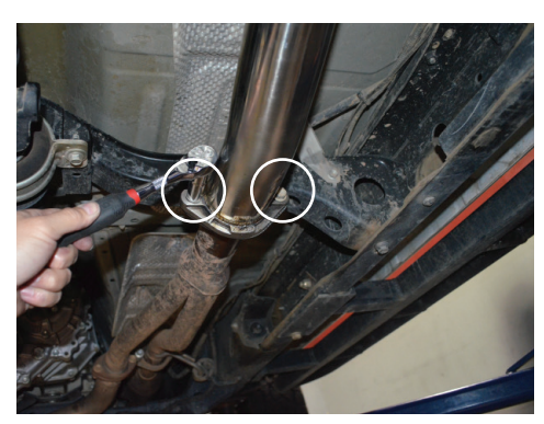
7. Secure the front pipe with the OEM bolts.