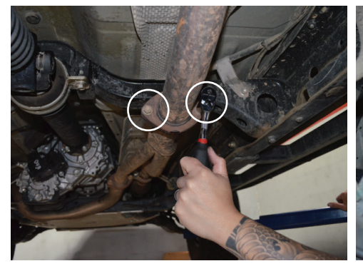
1. Remove the two OEM bolts securing the OEM exhaust.