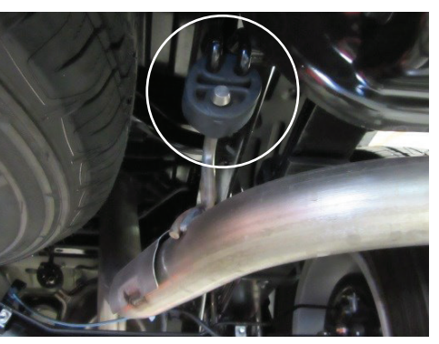
3. Detach the final hanger from the rubber insulator, then remove the OEM exhaust.